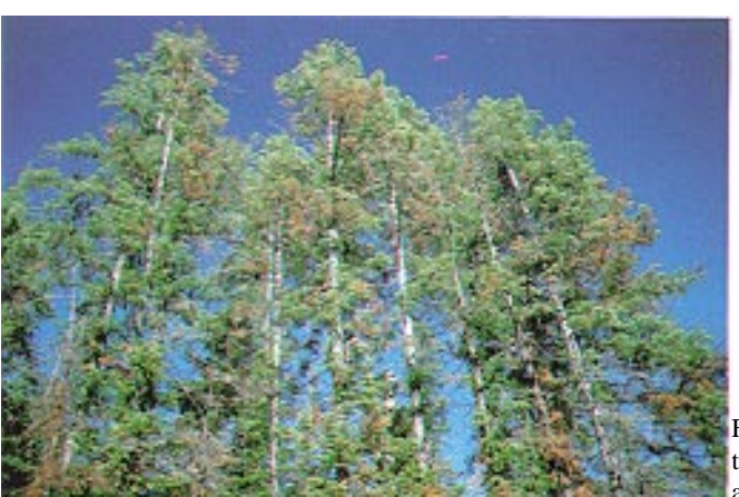
Flagging in grand fir caused by true fir dwarf mistletoe and canker fungi