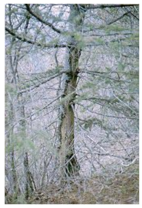
Bear Damage pn young Douglas-fir

May be Confused With: Root diseases, comandra rust.