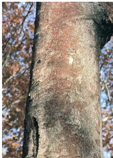
Figure 6 —A slime flux or tarry spot exudate on a tree that also bears isolated colonies of beech scale covered with woollike wax.