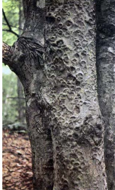
Figure 8 —The death of long strips of bark results in serious defect when underlying wood is invaded by insects and decay fungi.