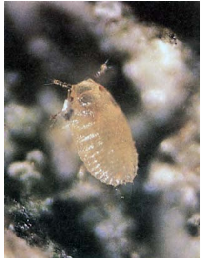
Figure 1 —Mature beech scale insects (about 1 mm long). The wax was removed before the photograph was taken.