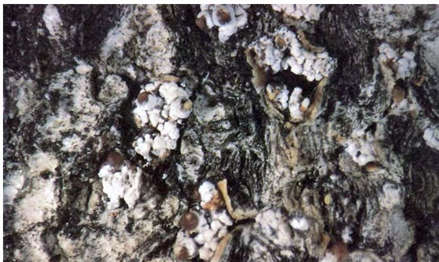
Figure 3 —Sexual fruiting bodies (perithecia) of N. coccinea var. faginata (about 0.3 mm in diameter).