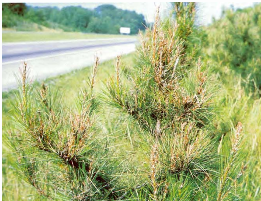
Figure 2.—Loblolly pine severely damaged by the Nantucket pine tip moth.