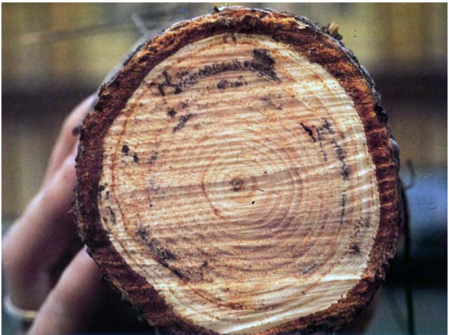
Figure 4 – Cross section through affected root showing arc-shaped pattern of black stain.