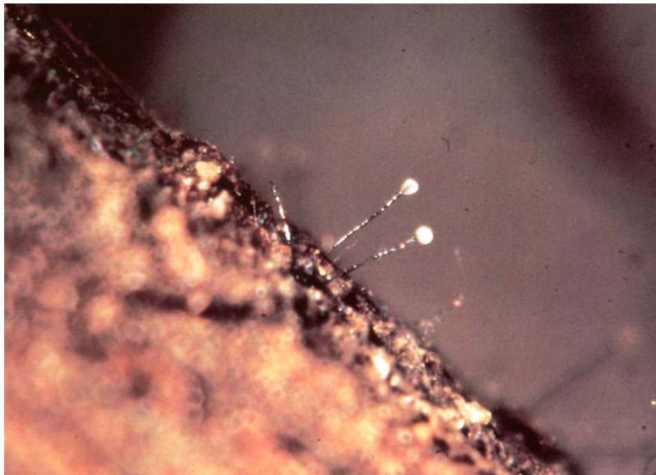
Figure 9 – Enlargement (25x) of fruiting bodies of the black stain root disease fungus in an insect gallery, showing sticky spore masses.

Once established, the black stain fungus colonizes root and stem sapwood