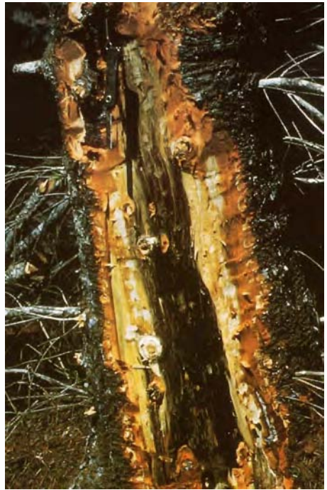
Figure 3 – Typical dark sapwood stain associated with black stain root disease.

Crown symptoms of trees affected by black stain root disease are very similar to those associated with other root diseases such as laminated root rot, armillaria root disease, and annosus root disease. Black stain can be distinguished from other root diseases by the distinctive chocolate brown to purple-black stain in the sapwood of roots and lower stems of infected trees (figure 3). When observed in cross-section, the black stain appears in arcs roughly concentric with the growth rings (figure 4). In contrast, blue stains, which are sometimes confused