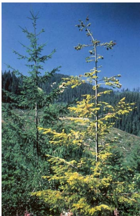
Figure 1 – Crown symptoms of black stain root disease on young Douglas-fir.

Trees infected by the black stain fungus usually exhibit symptoms of gradual decline before they die (figures 1 and 2). In early stages of decline, terminal growth is reduced and older needles become chlorotic. As the disease progresses, older needles are shed prematurely, new needles are somewhat stunted and yellow, and reduced internodal growth is evident on lateral branches. In advanced stages, new