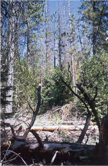
Figure 5 – Black stain root disease center in a second-growth ponderosa pine plantation.

with black stain, are usually a lighter color and typically are wedge-shaped in cross-section or they discolor the entire sapwood radius.