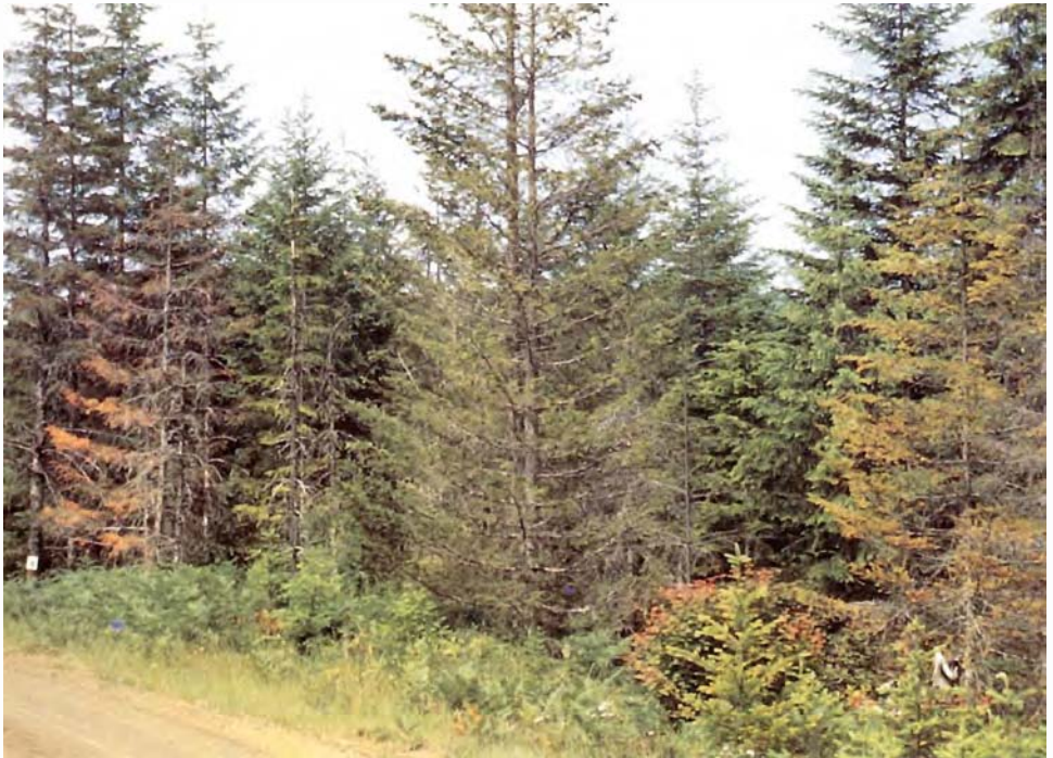
Figure 6 – Typical black stain root disease center in a Douglas-fir plantation.

Long-distance spread of the black stain fungus involves insect vectors (figure 8). The root-feeding bark