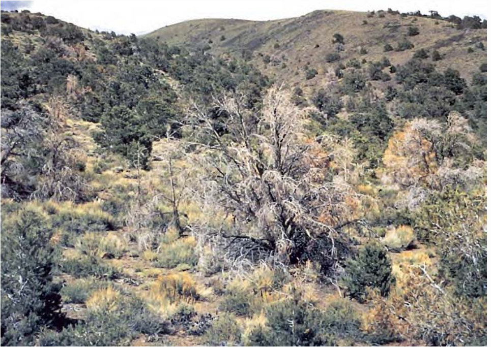
Figure 7 – Black stain root disease center in singleleaf pinyon.