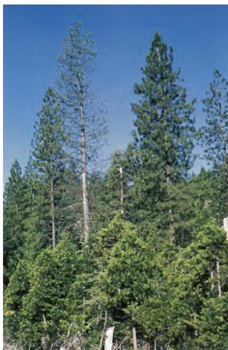
Figure 2 – Faded, sparse crown of ponderosa pine with black stain root disease.