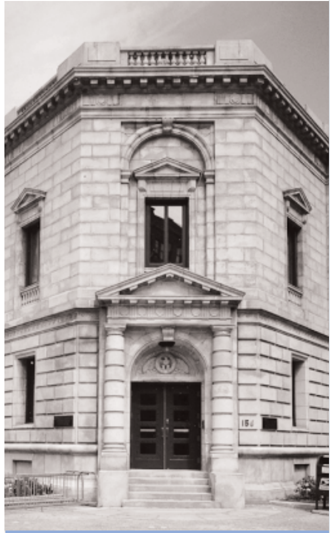
Edward T. Gignoux U.S. Courthouse, Portland, ME

Historic buildings are covered by these criteria in the same manner as other existing buildings (see Existing Construction Modernization in this section).