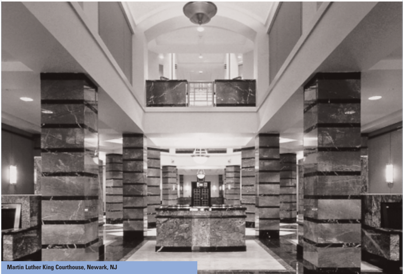
Martin Luther King Courthouse, Newark, NJ

Call buttons should be provided at key public contact areas and as needed in the offices of managers and directors, in garages, and other areas that are identified as high risk locations by the project-specific risk assessment.