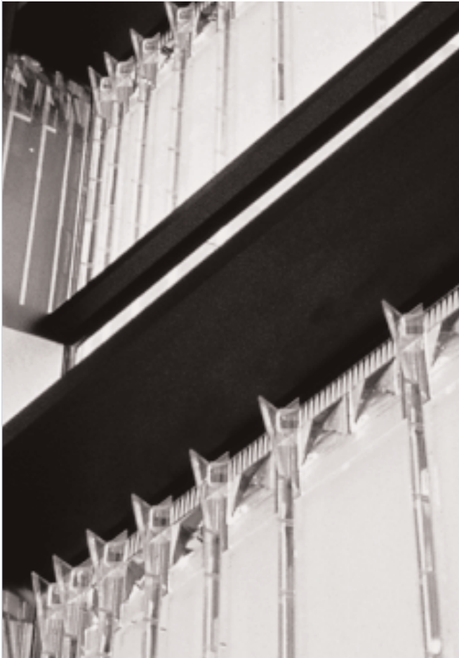
Oakland Federal Building

Landscaping design elements that are attractive and welcoming can enhance security. For example, plants can deter unwanted entry; ponds and fountains can block vehicle access; and site grading can also limit access. Avoid landscaping that permits concealment of criminals or obstructs the view of security personnel and CCTV, in accordance with accepted CPTED principles.