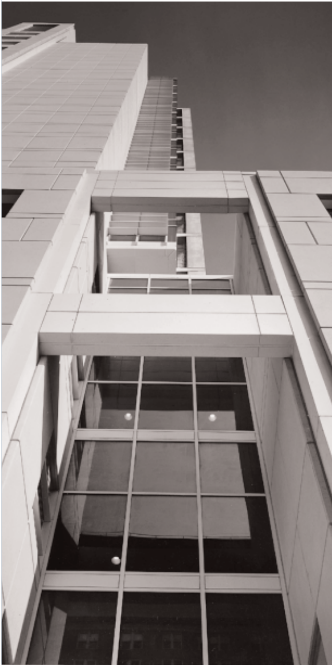
Sam Gibbons U.S. Courthouse, Tampa, FL