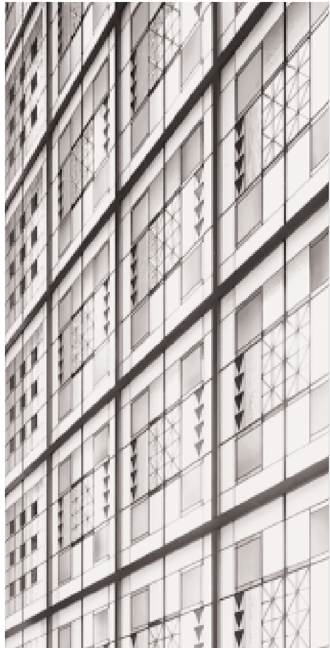
Robert C. Byrd Courthouse, Charleston, WV