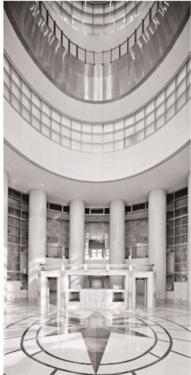
Thomas Eagleton Courthouse, St. Louis, MO

Effective site planning and landscape design can enhance the security of a facility and eliminate the need for some engineering solutions. Security considerations should be an integral part of all site planning, perimeter definition, lighting, and landscape decisions.