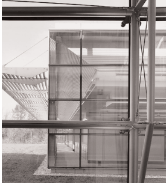
U.S. Census Bureau, Bowie, MD