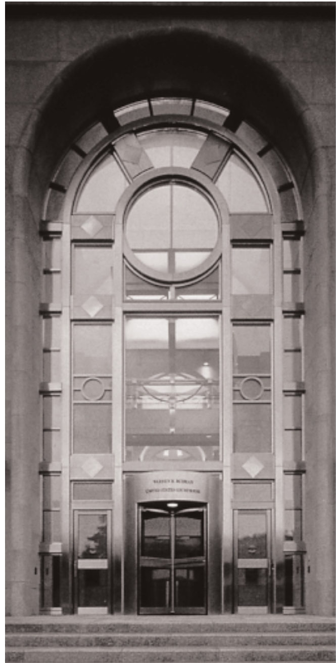
Warren B. Rudman Courthouse, Concord, NH

Roof Access. Design locking systems to meet the requirements of the International Building Code and limit roof access to authorized personnel.