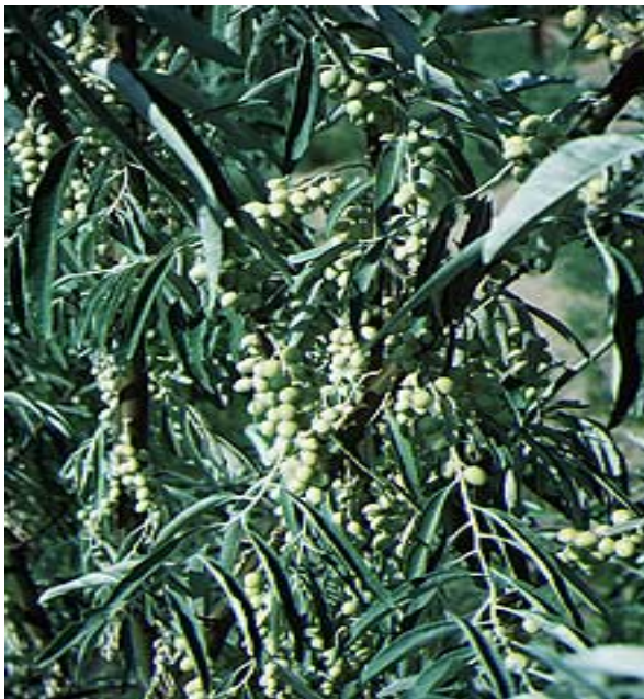
Russian-olive fruit are readily eaten by birds and mammals. Each fruit has a single seed in the center.

Russian-olives grow well in uplands that receive as little as 8 inches of mean annual precipitation (Laursen and Hunter 1986), and consequently, it was commonly included in multi-species windbreaks and shelterbelts throughout the West. Rocky Mountain juniper ( Juniperus scopulorum ) and Siberian peashrub ( Caragana species) are equally as drought tolerant.