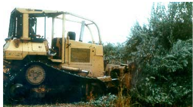
Dozing Russian-olives near Richland, WA. Severed top growth was piled and burned. Soil disturbance was considerable.

Disadvantages: A skilled operator is needed. Follow-up treatment will be required to control root sprouts. The spoil material must be dealt with by piling and/or burning. Burn permits may be needed and difficult to obtain. Dozing can be indiscriminant, causing damage or mortality to desirable species. Dozing leaves the soil bare and prone to erosion and weed invasion. Soil compaction and profile disturbance frequently occurs, and complicates reclaiming the site.