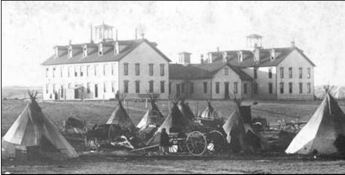
U.S. school for Indians, Pine Ridge, S.D. 1891

~ Captain Richard Henry Pratt, Founder, Carlisle Indian School, PA