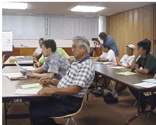
Workshop I participants listen to an introductory briefing and learn about the planning process. Hilo, Hawaii.

The purpose of the meeting was twofold. Information about the planning process was presented during the first half. The second half was structured as a charrette or workshop with small groups adding, deleting, and revising bikeway proposals on the working maps. Participants were also asked to complete a bicycle user's survey.