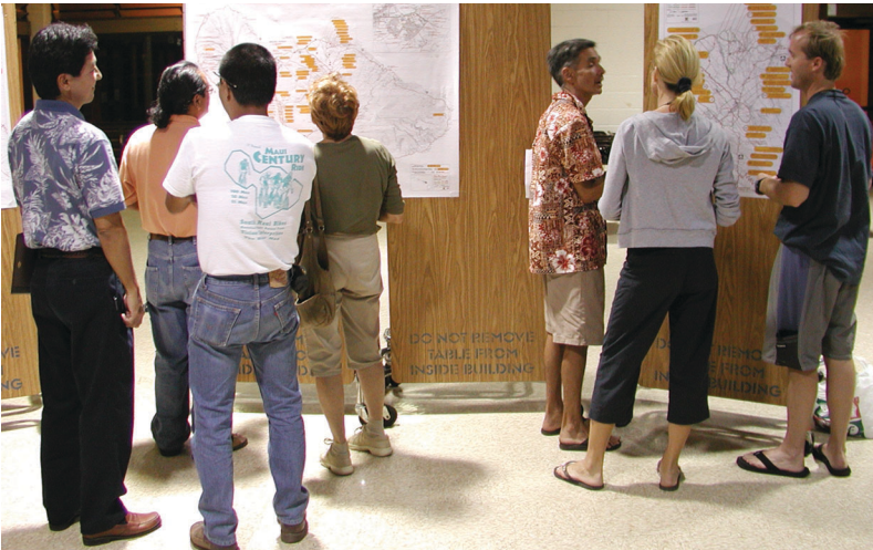
Workshop 2 participants had a chance to review and discuss the preliminary bikeway proposals. Wailuku, Maui.

Surveys. Additional information about user characteristics, needs, and preferences were obtained through three surveys: one of workshop participants, a random telephone survey, and a survey of school administrators. The findings of these surveys are presented in Chapters 3 and 4; questionnaires are found in Appendix A.