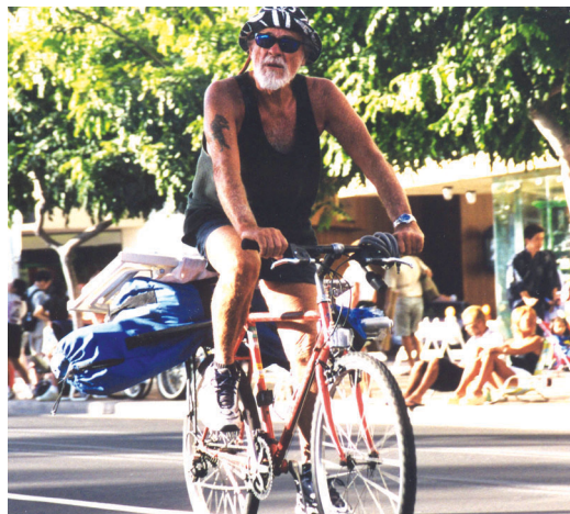
Bicycles are a versatile mode of transportation. For example, serving the occupational needs of police bike patrols (above) and the everyday mobility needs of people and their goods (left). Waikiki, Oahu.