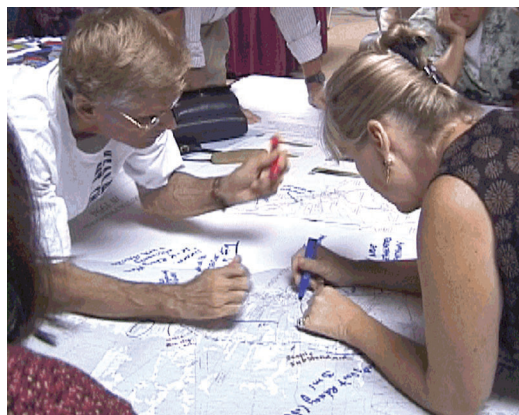
Participants draw bikeway alignments and annotate maps with comments about existing bike routes and ideas for new ones. Kona, Hawaii.

PROCEEDINGS OF THE TWO ROUNDS OF PUBLIC MEETINGS CAN BE FOUND IN THE SUPPLEMENTAL VOLUME ON COMMUNITY PARTICIPATION IN BIKE PLAN HAWAII.