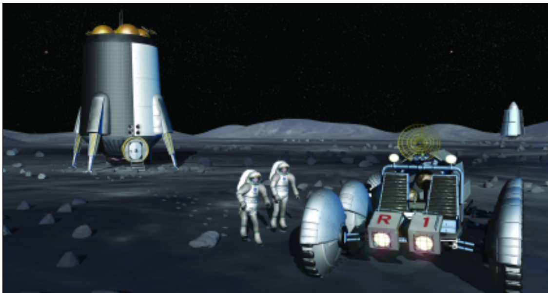
This artist's rendering represents a concept of possible activities during future space exploration missions. It depicts a crew preparing to leave a work site on the lunar surface.