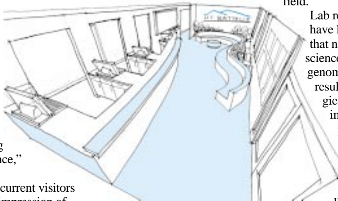
Artist's sketch of the new visitor center.