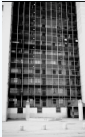
An ORNL-inspired collaboration is dispelling the darkness that plagues public housing.