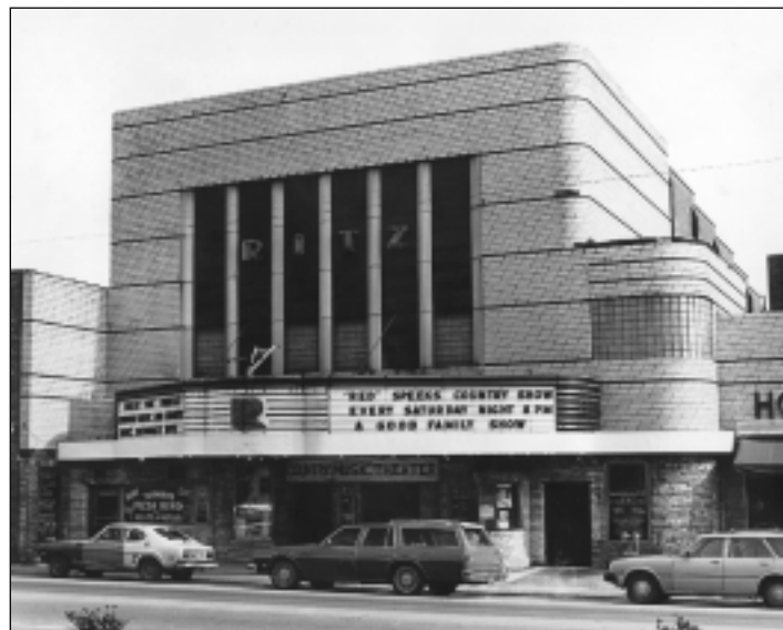
Theater goes in Clinton and the surrounding area will be able to again enjoy the art-deco environs of the Ritz.