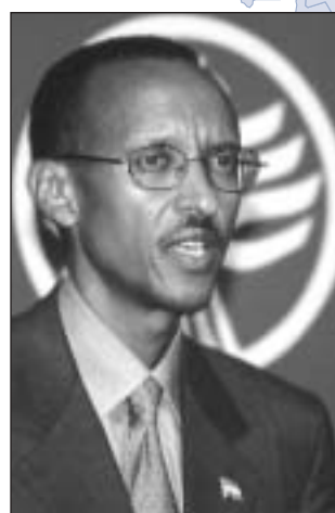
Left: Rwandan president Paul Kagame.

cut across national life—from government to private sector to civil society.