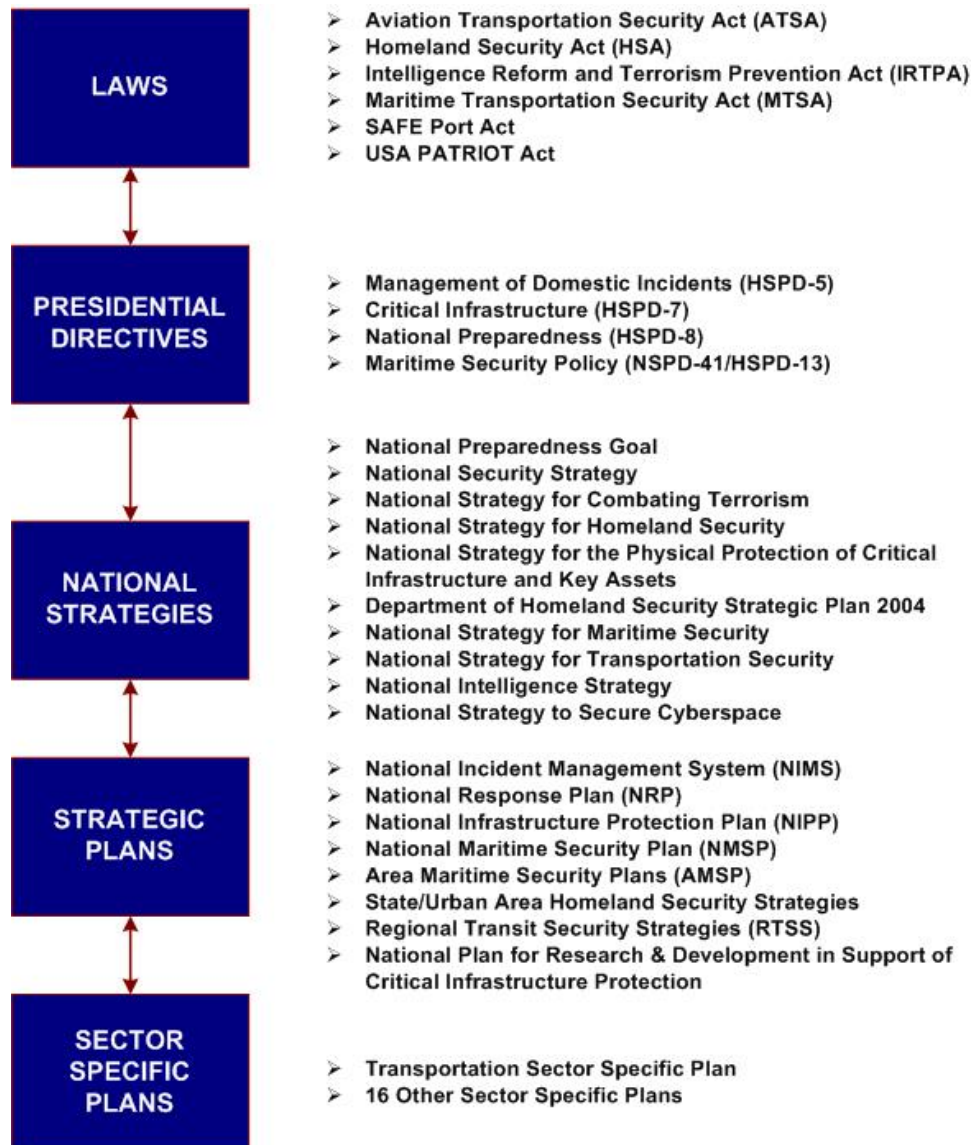
Figure 1. Laws, Strategy Documents, Directives and Plans That Impact the Infrastructure Protection Program

Figure 1, below, graphically summarizes key elements of the national preparedness architecture. The Infrastructure Protection Program seeks maximum alignment with this architecture.