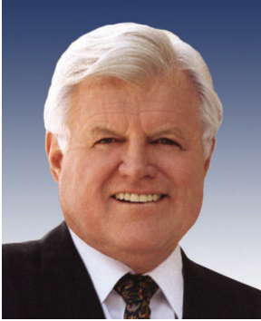
Sen. Edward M. Kennedy of Barnstable Democrat—Nov. 7, 1962