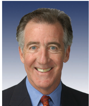
Richard E. Neal of Springfield (2d District) Democrat—9th term