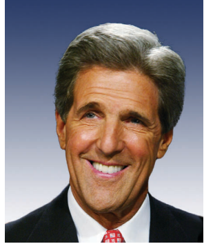
Sen. John F. Kerry of Boston Democrat—Jan. 2, 1985