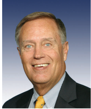
Michael G. Oxley of Findlay (4th District) Republican—13th term