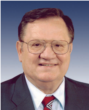
Paul E. Gillmor of Old Fort (5th District) Republican—9th term