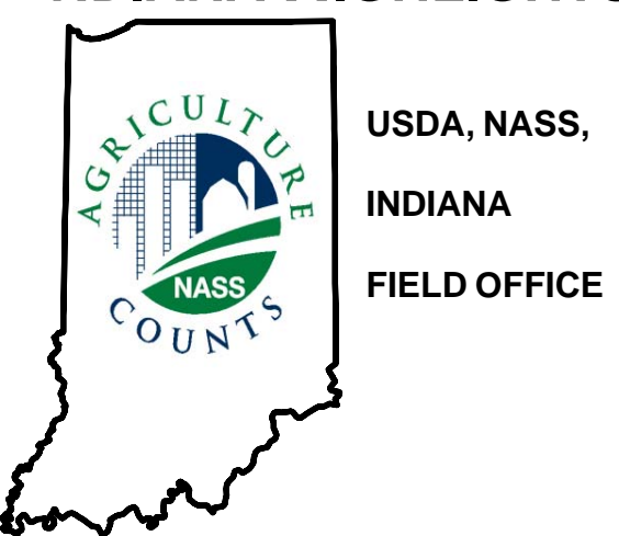
"Fact Finding for Agriculture"