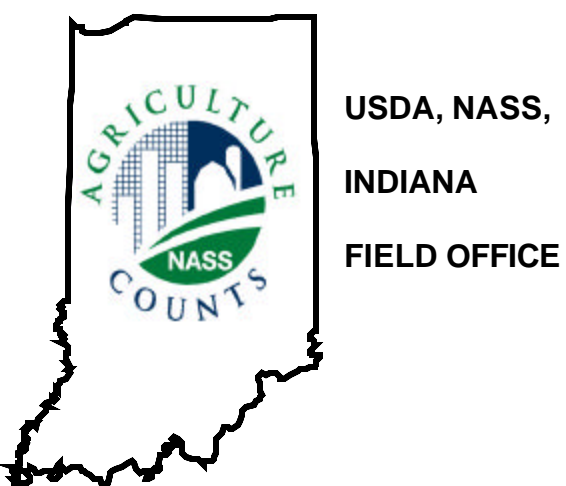
"Fact Finding for Agriculture"