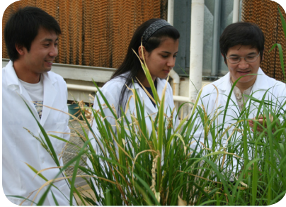
Above: Observation of rice growth in green house.