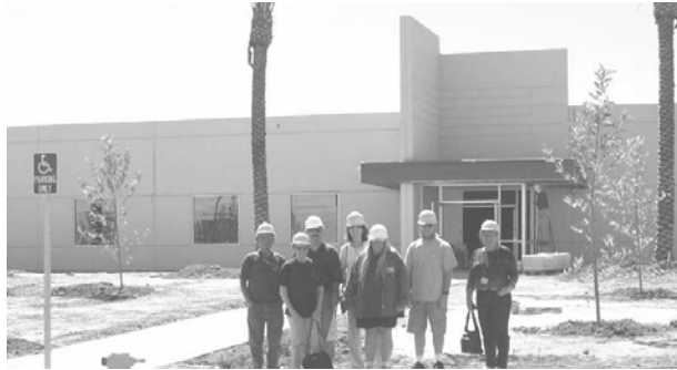
Top: Artist's rendering of the new Perris, CA, records center. Above: NARA staff on a recent visit to construction site.