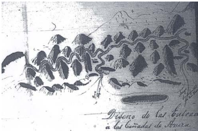
Hand-drawn "Diseño" map of Spanish land grant, from federal court records, part of NARA's "Teaching American History" CD.

The Laguna Niguel Regional Archives is participating in two grant funded projects in the Anaheim and Baldwin Park schools through the US Department of Education's Teaching American History program. The purpose is to educate teachers on the resources available at the National Archives and to work with individual teachers to identify historic documents they can use in the classroom.