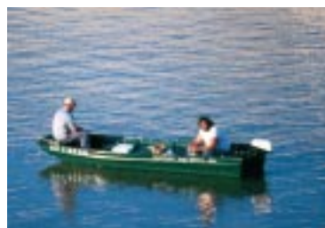
TOP: Residential development downstream of the dam has caused a change in the dam's hazard classification. MIDDLE: Kentucky dam safety regulations require the dams to be upgraded to meet safety criteria, or breach of the dam could result in loss of flood-control benefits. LEFT: Residents depend on these lakes for recreation and for drinking water supplies.