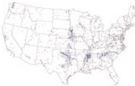
Small watershed projects

More than 600 dams need to be rebuilt and upgraded to ensure the safety and health of those downstream. In addition, another 1,500 dams need repairs so they can continue to provide flood control, municipal water supplies, recreational activities, water for livestock, and wildlife habitat. An estimated $540 million is needed to rehabilitate these dams.