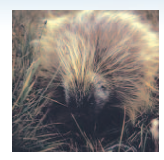
Porcupine Erethizon dorsatum

I,300 pounds), they can appear and disappear in thick brush with surprising stealth. Moose are usually solitary, except for cows with calves and during the fall rutting season. Cows give birth in the spring to one or two small, reddish calves, though usually no more than one survives. A calf will stay with its mother for two years before the cow drives it off as she prepares to have more young. Their diet includes willow leaves, grasses, herbs, and aquatic vegetation. Only bulls grow antlers.