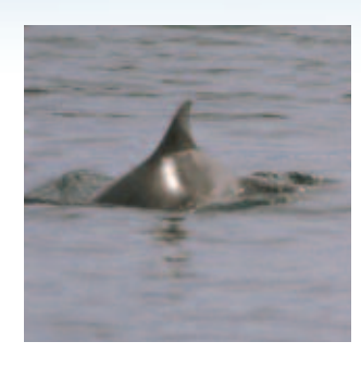
Harbor Porpoise Phocoena phocoena

speed. In the water they become fluid, executing a seemingly endless series of underwater flips, turns, and rolls. Mature males can weigh almost 2,000 pounds, but females average only 600 pounds. During mating season, large bulls compete at established rookery sites on Glacier Bay's outer coast to collect harems of females. Unsuccessful and immature males often congregate at haul-out areas like South Marble Island. Though the number of sea lions is growing in the bay, the population in Western Alaska has decreased by 80 percent since the late-1970s leading to that portion of the population's current listing as endangered.