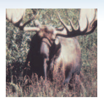
Moose Alces alces

The largest member of the deer family is a recent newcomer to the bay. The first moose was spotted here in the late 1960s. Despite their tremendous size (bulls can weigh 1,600 pounds and cows