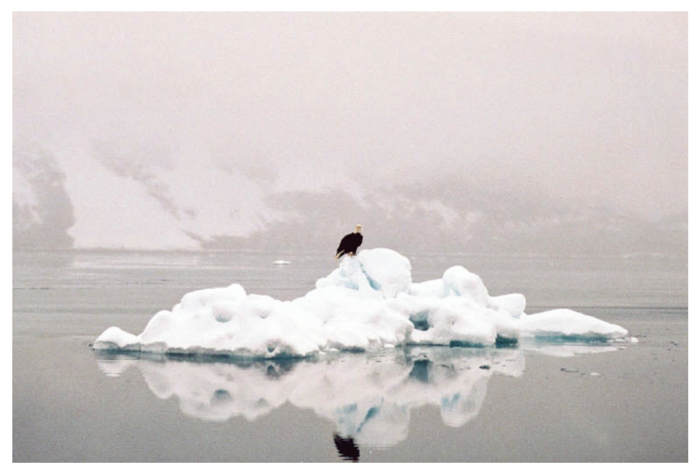
A Bald Eagle rests atop a small iceberg.