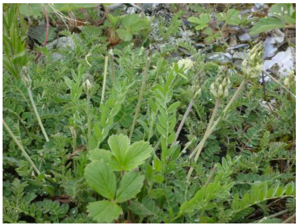
Grazed Oxytropis flowers in Queen Inlet.

It was a fantastic summer for seeds and berries in Glacier Bay, and this was reflected in the scats of bears throughout the Bay. Strawberry and soapberry were heavily targeted in the upper Bay while strawberry, salmon berry and devil's club berry were big hits in Sandy Cove. We were surprised to see the large amount of flowers and seed heads of Oxytropis campestris , both grazed and in scat. In past studies we have observed bears' use of the root and occasional foraging of seed heads, but this year we noted the seed heads in numerous scats and in certain meadows the grazing was so intense that the plants looked like they had been mowed.