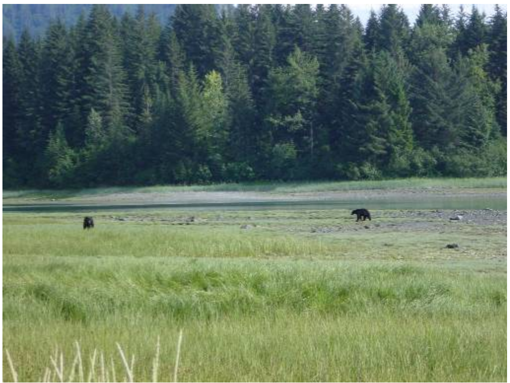
Two black bears interact in South Sandy Cove.

Preliminary analysis of data from 2004 will occur this winter. The summer of 2005 will be the second and final season of field work, after which the data will be analyzed and a final report to the Park will be written.