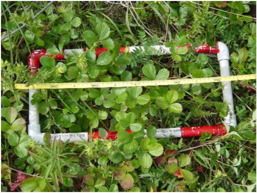
Vegetation plot along a transect line in a "mixed herb" habitat zone.

In each study area, we delineated the boundaries of different habitat zones, and then ran transects through each zone on which we randomly placed a small rectangle to determine our plot. In each plot we estimated the percent cover of each plant species and counted the number of berries on berry producing plants. Data from these plots gives us an average percent cover of each plant in the area and an overall characterization of the habitat zone.