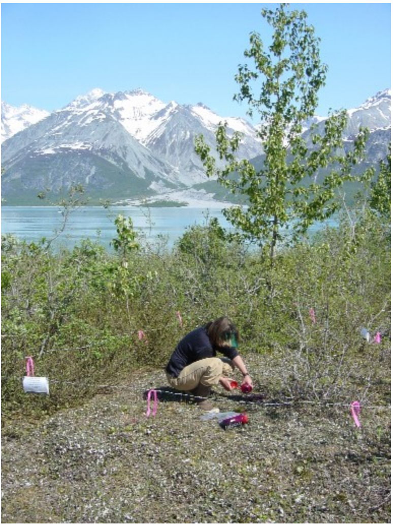
Deploying bear attractant scent at a hair trap in Tarr Inlet.

At each study site we also deployed at least one bear hair trap, a triangle of knee-high barbed wire strung around a pile of sticks or rocks on which a steamy quart of rancid cow's blood and fish oil was poured each visit. Bears were lured into the traps by the enticing scent and left clumps of fur on the barbs, which can be genetically analyzed for species, sex, and individual identification. Results from this analysis will indicate how many different bears have used the area between our visits. Hair traps were placed far off the beach and in thick scrub where people are unlikely to be walking. Bear hair was also collected opportunistically from rub trees, trails and beds.