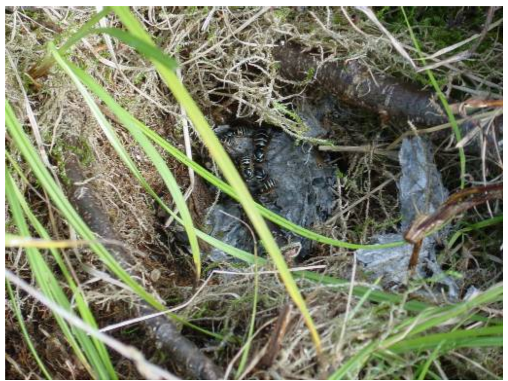
Remains of wasp nest in Russell Passage.

We also saw bumble bee parts in many scats in smaller quantities. We found hair and body parts of what we suspect to be bear, in scats in two different locations. Otherwise it looked as if bears were eating the usual assortment of berries, grasses, herbs, and barnacles. The pink salmon runs seemed late and small: streams that we have seen teeming with pink salmon in July of past years had only a few fish by the end of August this year. We found only a handful of scavenged fish and scats containing fish parts in all our study areas.