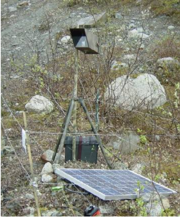
Video camera and solar panel set up in Reid Inlet.

Sony video cameras were tucked into shrubs on rock knolls above each study site. A marine battery and solar panel kept the camera running through the summer and a small electric fence protected the equipment from bears. The cameras were preset to film \frac{1}{2} second of tape (about 12 frames) every minute. This film will be analyzed to determine a general index of overall bear activity by comparing the number of frames containing bears with the number of frames with no bears present.