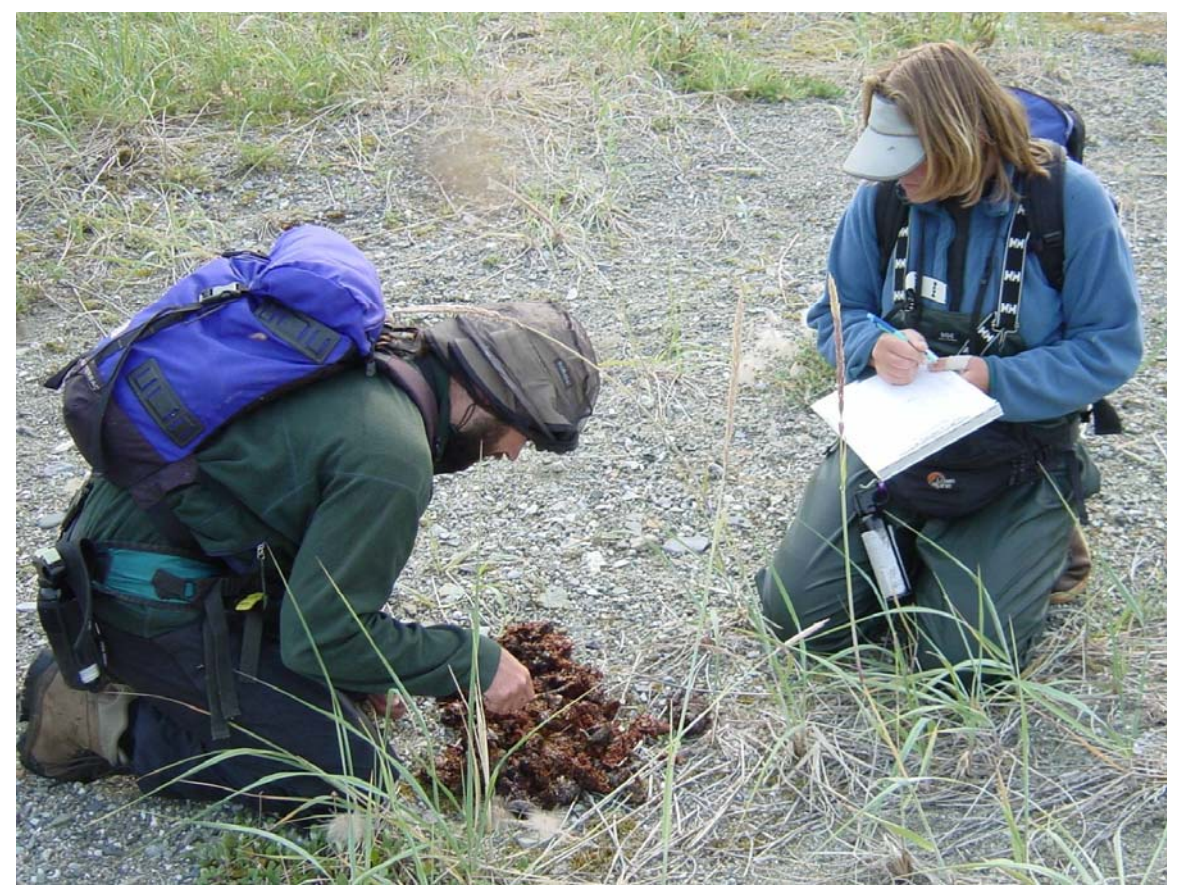
Examining the contents of bear scat (otherwise known as "poking the poop").

In order to find out what foods bear are targeting, we examined each scat we found for contents. Scats that were too complex to examine in the field were collected and later sieved for more detailed analysis. In order to determine the relative importance of each plant species to bears, plants that were observed or known to be bear foods were collected from each study area for nutritional analysis. Other bear foods such as barnacles, mussels, and spawning salmon were also collected opportunistically. A number of these bear food samples will also be sent off for stable isotope analysis to determine the carbon and nitrogen signature of each food source. This can be compared to stable isotope analysis of bear hair to determine the percentage of marine versus terrestrial foods that bears in each study area are consuming.