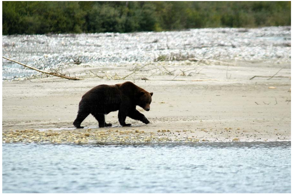
Brown bear in Tidal Inlet

In Glacier Bay National Park encounters between kayakers and black and brown bears are of great concern, both because of potential threat to human safety as well as potential displacement of bears from important seasonal habitats. Little is known about the black and brown bears in GLBA, and as a result it has been difficult to evaluate seasonally important habitats in relation to their importance to bears. In order to evaluate current camping closure areas as well as potentially important foraging areas within the park, managers need information regarding how bears use specific sites.