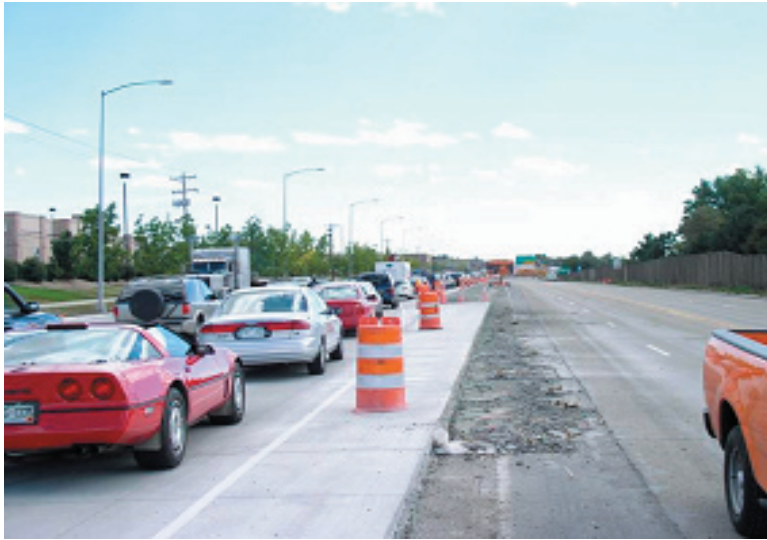
Figure 7. Phased construction of thin whitetopping on State Highway 83 (Allen 2005).