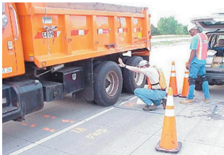
Figure 3. Load testing an instrumented slab with a 180-kN (40-kip) tandem axle (Ardani 2005).

testing was conducted on newly constructed and instrumented TWT pavements. The design procedure was modified based on the new data and analysis results, and the revised guidelines were completed in 2004 (Sheehan, Tarr, and Tayabji 2004).