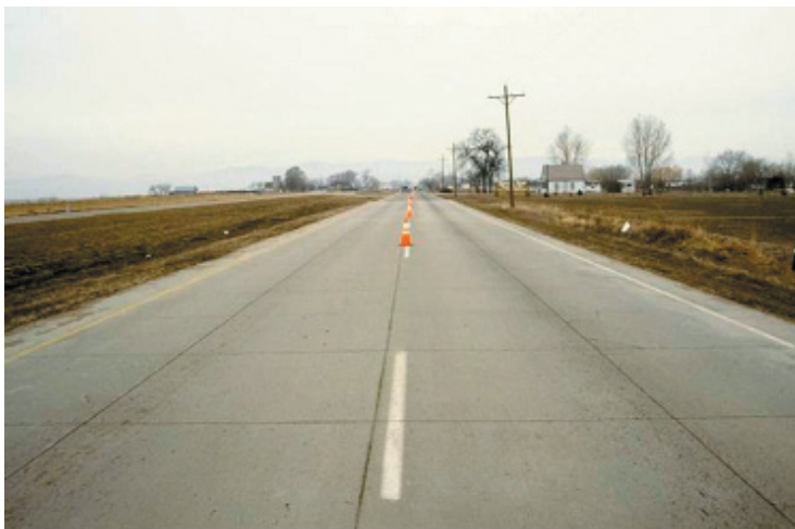
Figure 2. The first thin whitetopping project in Colorado, on SH 68 near Ft. Collins (Ardani 2005).

The trial TWT project consisted of two 91-m (300-ft) test sections placed over an existing AC pavement: a 90-mm-thick (3.5-in.) section with 2.0 by 2.0 m (6.5 by 6.5 ft) slab panels, and a 125-mm-thick (5-in.) section with 3.7 by 4.0 m (12 by 13 ft) panels, as shown in Figure 2. No treatment was applied to the existing AC surface prior