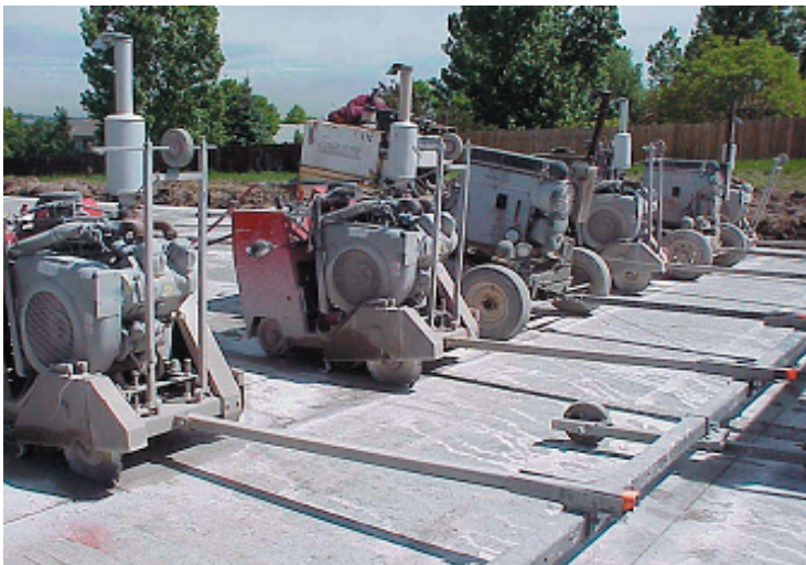
Figure 4. Longitudinal joint sawing (Lowery 2005).

CDOT conducted a detailed life-cycle cost (LCC) analysis of TWT to determine if TWT could be justified on the basis of cost (Lowery 2005). The results showed that the cost of TWT is similar to a program of periodic AC overlays based on project cost alone. Considering only the agency cost, the LCC of TWT was only 1 percent more than the AC overlay option. With such a small difference, the LCCs of the two options were considered equivalent. The LCC model assumed that the AC overlay option would require rehabilitation every 10 years with 50-mm (2-in.) AC, which has been the experience in Colorado. For TWT, a 20-year service life was assumed with one grinding, 10 mm (0.375 in.) deep, for smoothness. When user costs are considered, the TWT becomes a more attractive rehabilitation strategy, owing to its longer service life and low maintenance requirements. With consideration of user-delay costs, the LCC of TWT was