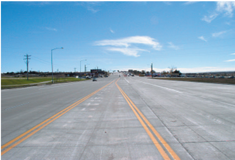
Figure 8. Completed thin whitetopping on SH 83 (Allen 2005).

was returned to its normal six-lane configuration in 65 working days, and the contractor earned the entire incentive. A total of 90,100 m 2 (107,775 yd 2 ) of TWT was placed.