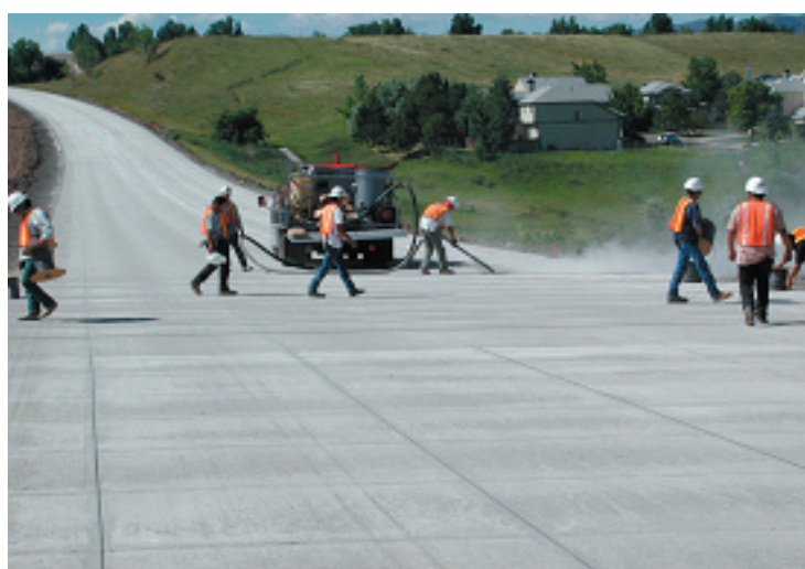
Figure 6. Cleaning (air blasting) joints prior to applying joint sealant on SH 121.