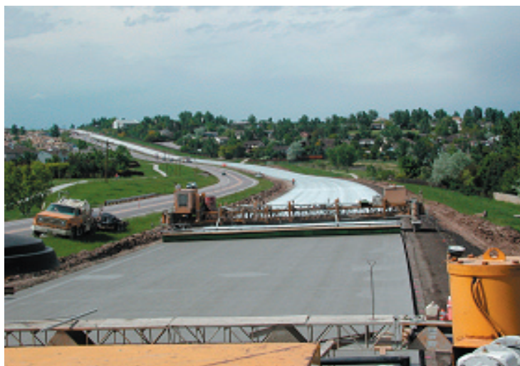
Figure 5. Placing concrete and applying curing compound on SH 121.

The design of the TWT for the Wadsworth Boulevard project included a 150-mm-thick (6-in.) concrete overlay and 1.8-m (6-ft) joint spacing in both directions, placed over the existing AC pavement after milling. The project included all four lanes of a 5.6-km (3.5-mi) stretch of SH 121, including two major intersections and many horizontal and vertical curves in the highway geometry. A total of 130,000 m 2 (155,400 yd 2 ) of TWT was placed in 67 days. A fast-track mix that provided a compressive strength of 17 MPa (2,500 psi) in 24 h was used for intersection paving. The TWT was constructed full width, 11.5 m (38 ft), over the length of the project. The intersections were constructed in three separate 24-h closures. Extensive use of public relations and message boards was a key part of informing the public of closures, and it resulted in positive comments on how fast and efficiently the project was completed. Views of the TWT construction are shown in Figures 5 and 6.