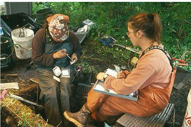
Archaeologists record information about an artifact found at an Alutiiq site during the summer of 2002.