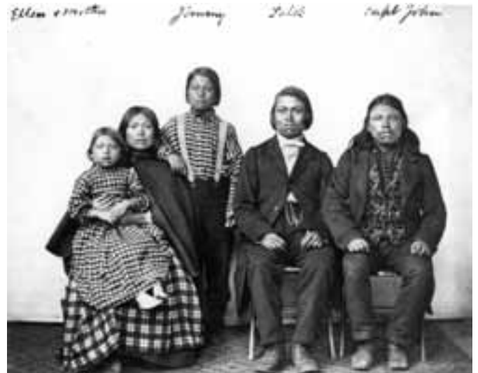
University of Washington Libraries, Special Collections, NA0410

tsunami-evacuation map, 102n Nehalem, Oregon, tsunami-evacuation map, 102n Nehalem River estuary, Oregon: archaeological sites, 20m radiocarbon ages of spruce stumps and herbaceous plants, 25 weaving probably left by 1700 tsunami, 21 Nestucca, Oregon; tsunami-evacuation map, 102n Netarts Bay, Oregon: radiocarbon ages of herbaceous plants, 25 tsunami-evacuation map, 102n Newport, Oregon; tsunami-evacuation map, 102n New Westminster, suburb of Vancouver, British Columbia; tall buildings and shaking hazards, 104-105 New York City: population density of Manhattan, compared with density in early 18th-century Edo, 61 population in 1700, 5n Niawiakum River, arm of Willapa Bay, Washington: 1700 tsunami deposit, 18 archaeological rocks, 20m radiocarbon ages of spruce stumps and herbaceous plants, 25 Nikkō 日光, shrine to the shogun Tokugawa Ieyasu; weather during 1700 tsunami, 72 Ninomiya Saburo, staffer of Miyako weather station in 1960; matched tsunamis in Japan with earthquakes and tsunamis in South America, 54 Nootka Sound, British Columbia; in Makah flood tradition, 12-13 Norinowaki 法之脇, village near Tsugaruishi: first kanji, transcribed as verb 乗, 52 photograph of 1960 tsunami, 51, 56m North America Plate, slab of Earth's crust and mantle: active faults within, 8, 104 motions detected by satellite, 99 overrides Juan de Fuca Plate at Cascadia subduction zone, 8, 99, 104