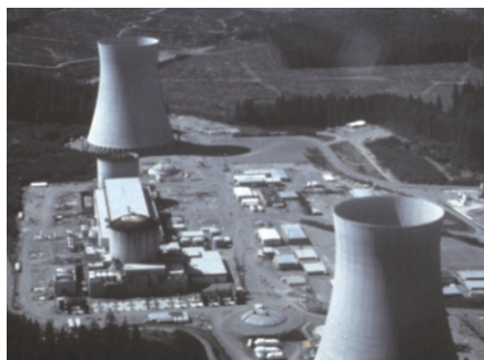
The Nuclear Regulatory Commission, reviewing the design of this power plant, supported carbon-14 dating of Cascadia earthquakes (p. 25).

The paper by Andō Masataka, with Emery Balazs, initiated the study of cyclic land-level change at Cascadia (Ando and Balazs, 1979). We consulted Ward and others (1989) and Tufte (1990, 2001) on book design.