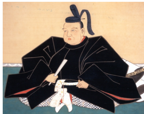
Date Masamune , daimyo of Sendai-han, is associated with the earliest known writing of 津波 (p. 41).

Idaho, hazard from seismic shaking in; small contribution by great Cascadia earthquakes, 105 Ihara Saikaku (1642-1693), writer of short stories and poems, 63 Ilwaco, Washington town near Columbia River mouth; tsunami-evacuation map, 102n Imaizumi 今泉, district headquarters for Edo-period Ōfunato, 81 “Inamura no hi” (“The rice-sheaf fire”), 47, 113 Inarinoshita 稲荷の下 (“below Inari shrine”), 1700 tsunami limit in Tsugaruishi, 50, 52, 56-57 Indian Ocean tsunami of 2004: earthquake as natural warning, 4 precedent for, 5n tide-like waves, 80 Ishikawa Tomonobu (c. 1660-c. 1721), poet, illustrator, mapmaker: career, 29 travel map of Japan, 29-31 world map, 28, 29 Isohama 磯浜 (now Ōarai 大洗), shipwreck site near Nakaminato, 67