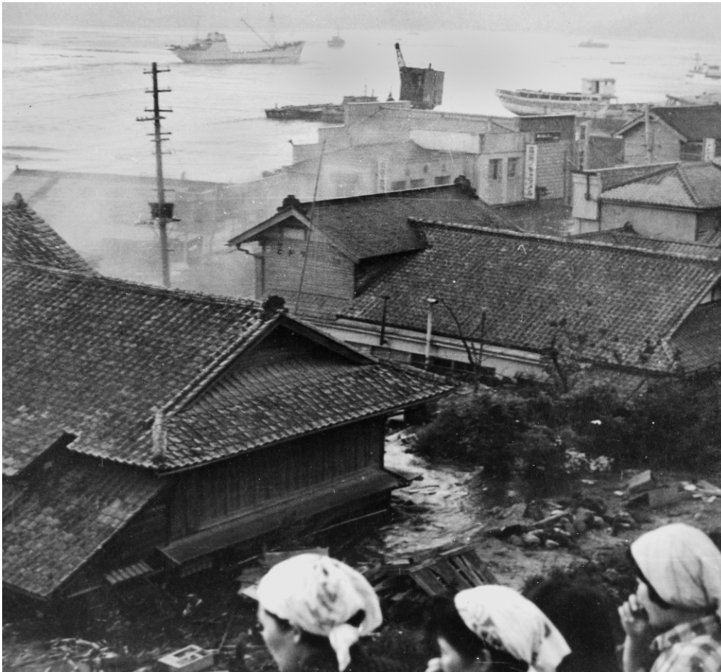
A wave from Chile in 1960 approaches roofs of Ōfunato, Japan (p. 81).

Zodiac, Chinese; uses in Edo-period Japan: compass directions, 43 hours, 44 sixty-year cycle, 42, 70, 77, 87