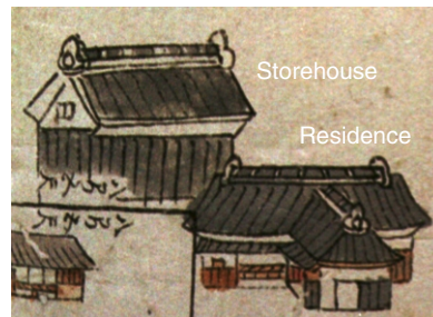
Ōuchi-family compound in Nakaminato, 1842. The storehouse may have then held Ōuchi-ke "Go-yōdome," the collection of shipwreck documents that refers to the 1700 tsunami (p. 66).

Tacoma, Washington, tall buildings and shaking hazards, 104-105 Tadokoro, family of hereditary mayors of Tanabe; official and private records of 1700 tsunami, 84-85 Tanabe 田辺, castle town for part of Wakayama-han: devastation during 1707 earthquake and tsunami, 89n estimated height of 1700 tsunami, 90 merchants in 1725, 85 moat, ascended by 1700 tsunami, 84-86, 90 Tadokoro-family documents, 84 "Tanabe-machi daichō," municipal records of Tanabe, 1585-1866: entry on 1700 tsunami, 34, 86 quoted briefly, 40, 87, 88, 90 volumes stored temporarily in Tanabe library, 84 water damage, 87 Taxes: Collected at port of Kuwagasaki, 36n Divided among recipients near Ōtsuchi, 58n Levied on samurai of Morioka-han, 61n Tide-gauge measurements: land-level changes in Japan, 65 tsunamis in Crescent City, California, 49 tsunamis in Japan, 46, 73, 94-95