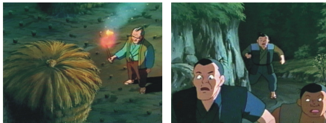
The headman torches his harvested rice. Villagers rush uphill to fight the blaze. Awaiting stragglers, he says, "Let it burn!"