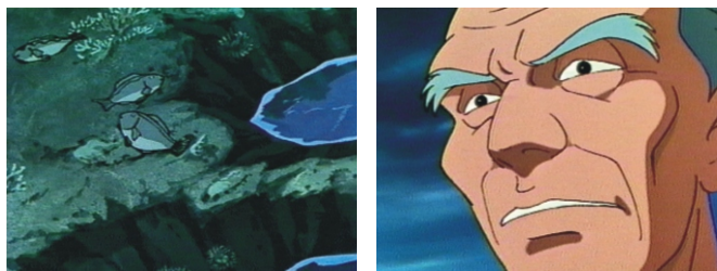
The sea withdraws. The villagers remain on low ground, too far to hear their headman. How can he save them?