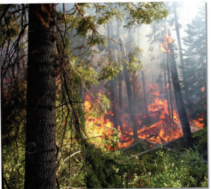
As of Inside ODOT's publication date, fires have burned more than 167,000 acres in Oregon, with six major incidents.

For ODOT employees in Region 5, this means continued vigilance in protecting the safety of travelers and supporting firefighting efforts near state routes. Actions included complete closure of highways that run directly through fire areas, restricting traffic with flaggers, and using pilot cars when fire crews, equipment, smoke, danger trees or debris create hazardous driving conditions. In addition to keeping motorists safe in and around fire-impacted areas, Region 5 personnel also provided additional assistance, such as transporting fire retardant, building firebreaks and warning the public of possible fire-related safety concerns.