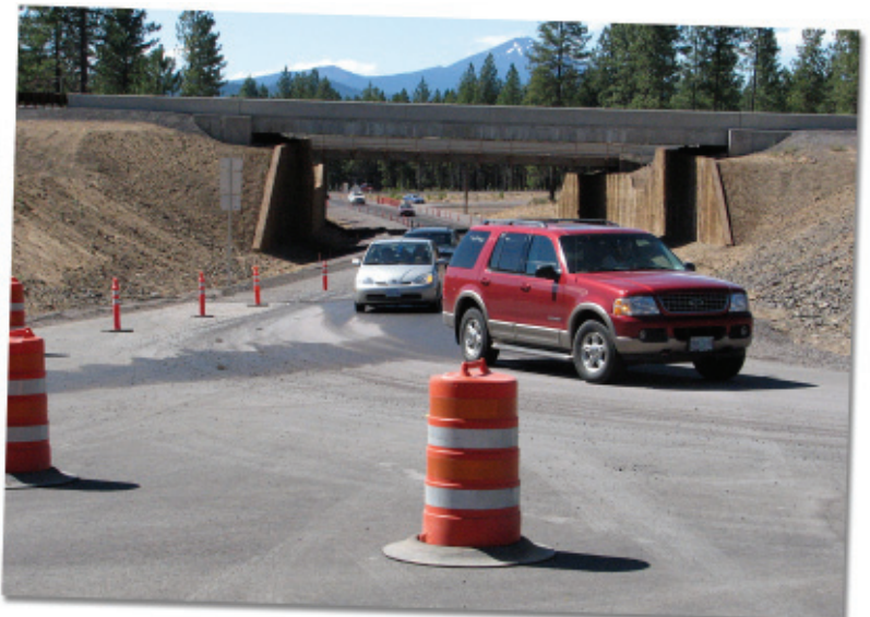
Traffic turns onto U.S. 97 from Century Drive during the Jeld-Wen Tradition golf tournament.

The U.S. 97 at South Century Drive project will eliminate a potentially dangerous intersection with U.S. 97 by constructing a classic diamond interchange, complete with two bridges, an underpass, and four ramps. Completion of the project is still a few months