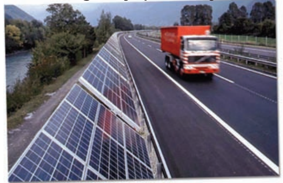
Solar panels on highways are common in Europe. The Office of Innovative Partnerships will test the possibility of using them in Oregon.

No, it's not something from the galactic future. It's here and now — and could be in Oregon within a year. Governor Kulongoski and the 2007 Oregon Legislature took several giant leaps toward making Oregon a leader in reducing greenhouse gases by passing the "Renewable Energy Package." Some 25 energy-related bills were signed into law, including the Renewable Portfolio Standard. The RPS says that Oregon must supply 25 percent of its electricity needs from new renewable sources by 2025. Interim targets include meeting five percent by 2011; 15 percent by 2015; and 20 percent by 2020. Governor Kulongoski further directed Oregon government to become 100 percent powered by renewable resources.