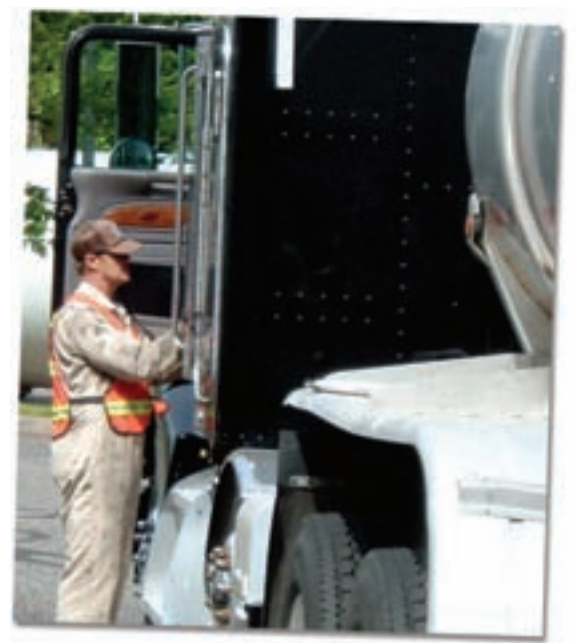
An inspector talks to a truck driver during a recent inspection.

Focus on logbooks The focus of the July and August inspection efforts was on drivers. MCTD inspectors checked drivers'