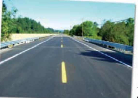
Region 5 donated ten bridge deck pieces for this completed bridge replacement project on Highway 47 in Region 1.

The new bridge, which cost about $400,000, is wider than the previous one with a deck of 40 feet. It's safer for bikes and pedestrians, with 8-foot shoulders instead of the 2-foot shoulders before.