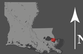
Image Source: Landsat 5 Thematic Mapper Satellite Imagery is provided by the USGS Center for Earth Resources Observation and Science. Bands 4 (near-ir), 5 (mid-ir), and 3 (visible red) are displayed.

U.S. Department of the Interior U.S. Geological Survey