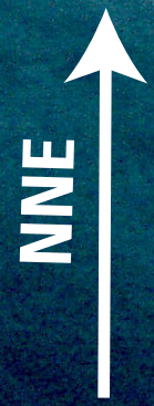
Photo Date: November 18, 2005