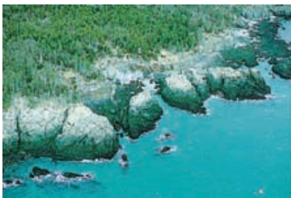
Figure 3. West Quoddy Head, Washington County, Maine. The rocky cliffs (steep slopes) of the Maine coast and the large tidal range lead to an index designation of very low risk.