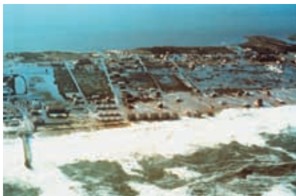
Figure 2. Rodanthe, North Carolina, during the “Halloween Storm” of 1991. The low coastal slope, barrier island morphology, small tidal range, and large waves make this high-vulnerability area particularly susceptible to flooding and overwash.

The USGS is conducting a national assessment of coastal vulnerability to future sea-level rise by using simple, objective criteria; the assessment for the U.S. East Coast has been released (Thieler and Hammar-Klose, 2000). More detailed investigations of the impact of sea-level rise are needed in order to forecast coastal change with a degree of certainty that is useful for the management of coastal resources.