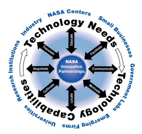
Figure 1. NASA's Innovative Partnerships Program is engaged in a dynamic process to match technology needs with capabilities.

IPP also seeks solutions to some of NASA's pressing technical challenges by funding Small Business Innovation Research and Small Business Technology Transfer projects; seeking cost-shared, technology development partnerships through the IPP Seed Fund; and tapping into new sources of innovation through NASA's Centennial Challenges prize program. IPP seeks to facilitate and catalyze innovative partnerships in two directions: technology infusion to provide technical solutions to some of the challenges being faced by NASA's programs and projects; and technology transfer-or spinoffs-to provide solutions to technical challenges in the private sector or other Government agencies with NASAdeveloped technology. In short, IPP is seeking to match technology needs with technology capabilities<sup>2</sup>, as illustrated in Figure 1. IPP achieves these objectives through a nationwide network of offices across NASA's 10 field centers.