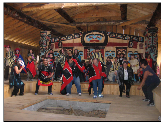
Above: Dancers performing at a traditional camp.