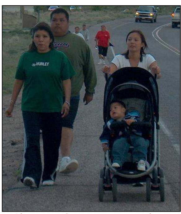
Above: Families participating in the community wellness walk.

The Pueblo of San Felipe, New Mexico hired a coordinator to develop a comprehensive health promotion program on nutrition, physical activity, and tobacco, and substance/alcohol prevention in the community.