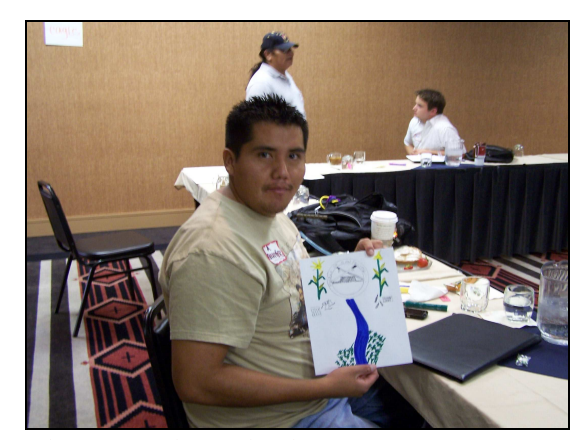
Above: Youth Leadership Institute participant, Albuquerque, New Mexico.

Overall, forty-four youth and adult mentors participated in the YLI trainings. Each team created an action plan to strengthen their communities. Adult mentors were on hand to assist youth in creating and developing implementation strategies. Area HP/DP Consultants will provide teams with on-going technical support and assist in finding other funds for youth led efforts. A one year reunion will be held in 2008 to convene all youth participants to share, reflect, and learn about other community projects.