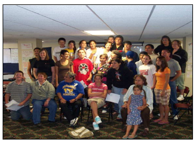
Above: Youth Leadership Institute Training, Lac Vieux Desert, Michigan.

The National HP/DP program and the Youth Leadership Institute (YLI) held trainings in Albuquerque, New Mexico and Watersmeet, Michigan to engage youth and their adult mentors to address local issues and concerns. The Institute provides skills to young people and adult mentors to build communities which respect, honor, and support youth health promotion efforts. During the two and a half day trainings, youth identified a community issue and applied the eight-step action planning cycle. Participants were given the opportunity to develop new skills in community building, team building, and creating positive social change.