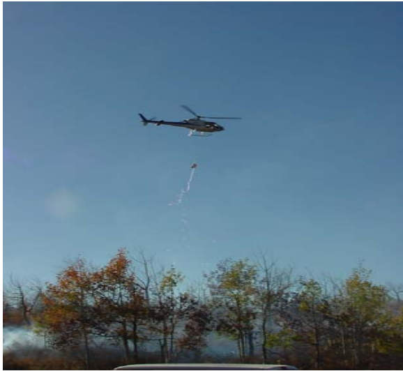
Aerial Ignition 2003 Boulder Mountain

LOGAN RANGER DISTRICT SPRING/FALL 2008/2009 UINTA-WASATCH-CACHE NATIONAL FOREST