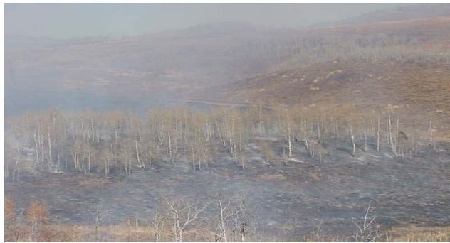
Logan Ranger District, 2003 Boulder Mountain