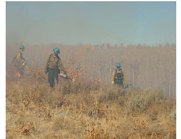
Hand ignition on 2003 Boulder Mountain

The purpose of the burn is restoration and maintenance of age-class diversity among aspen dominated stands. Additional benefits include the restoration of young age classes of aspen to benefit Wildlife species and to decrease the potential for high intensity wildfires with unwanted effects.