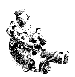
The storyteller figure symbolizes the values of the Memorial Fund—educating, supporting and inspiring our children.