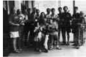
Fiddle students pose for a group portrait at the Augusta Heritage Center, Davis and Elkins College in West Virginia.

An economic impact study published by the National Assembly of Local Arts Agencies estimates that the nonprofit arts industry annu-