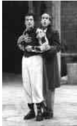
The Guthrie Theater in Minneapolis presents The Venetian Twins in a production supported by a 1998 Creation & Presentation grant.

On June 25, 1998, the U.S. Supreme Court issues its ruling in the case of NEA v. Finley . The 8-1 decision determines that the statute mandating the Endowment to consider "general standards of decency and respect for the diverse beliefs and values of the American public" in awarding grants is constitutional. The NEA continues its implementation of the statute through its panel review system that includes persons representing culturally diverse points of view.