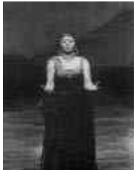
Leontyne Price in the title role of Verdi's Aida at the Metropolitan Opera in New York City.

Congressman Sidney R. Yates (D-IL) assumes chairmanship of the U.S. House Appropriations Subcommittee with responsibility for the Endowments.