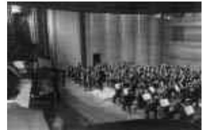
Lorin Maazel and the Cleveland Orchestra in performance and on television.