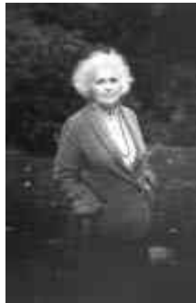
Grace Paley, the renowned short story writer, received a Fellowship from the Literature Program early in her career in 1967.

The National Council, at its sixth meeting in Washington, D.C., recommends the first grants to individual cre-