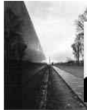
The Vietnam Veterans Memorial, designed by architect Maya Lin, was made possible through the wisdom of a Design panel at the Arts Endowment.

also charged with finding ways to bring more non-governmental professionals, private groups and individuals into the Endowment's decision-making process and to recommend ways to improve the management, organization and structure of the two Endowments and the Federal Council on the Arts and the Humanities.