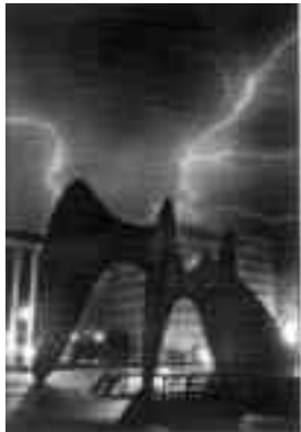
Silhouetted against a dramatic sky, La Grande Vitesse by Alexander Calder graces downtown Grand Rapids, Michigan, through a 1967 grant from the Visual Arts Program.