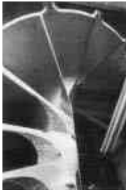
Sam Maloof, an artist who works in wood, received an Endowment Visual Arts Fellowship in 1984 and a MacArthur Fellowship in 1985.

Apprenticeships are begun through state arts agencies. The Theater Program begins a new Ongoing Ensembles category to assist groups of theater artists working together over time. The Dance Program starts a project placing choreographers with repertory