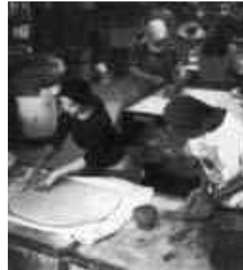
Ceramic students attempt slab work in the studios of the Manchester Craftsmen's Guild on the north side of Pittsburgh.

On September 29, 1995, the Endowment celebrates its 30th anniversary.