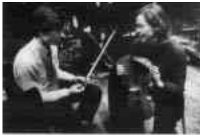
A student from the All-City High School Orchestra receives pointers from New York Philharmonic violinist Judith Nelson prior to their 1987 joint concert.

The National Assembly of State Arts Agencies reports that state arts appropriations for Fiscal Year 1987 reach $216.6 million, a record high. The National Assembly of Local Arts Agencies estimates that city and county government support of the arts will increase 109 percent from 1986 to 1988.