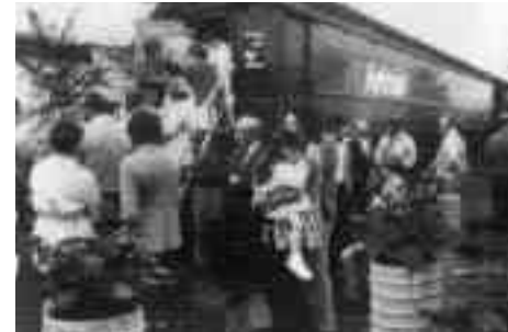
The Michigan Artrain brought works of art to small towns and communities around the country during the 1970s.

On May 26, 1971, President Nixon addresses the Associated Councils of the Arts meeting in Washington, D.C.: "The important thing now is that government has accepted support of the arts as one of its responsibilities — not