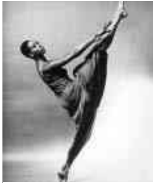
Dance , one of the exemplary

The Endowment's budget is $7.2 million and grants are made to 187 individuals and 276 organizations. Reauthorization for two more years of operation is approved by Congress despite some criticism about aiding the arts during the nation's growing involvement in Vietnam.