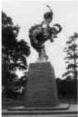
Vaquero captures the spirit of the West in Moody Park, Houston, an Art in Public Places commission and the work of Visual Arts Fellow Luis Jimenez.

The first White House Conference on Handicapped Individuals on May 23–27, 1977 focuses attention on the accessibility of cultural programs and facilities and the participation of disabled individuals in the arts.