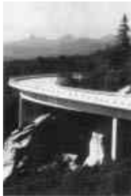
Excellence in Federal design achievements, such as the design for the Linn Cove highway, were recognized by the first Presidential Design Awards in 1984.

The Locals Test Program, in its first year of operation, distributes $2 million in Federal funds, which are to be matched by $9.7 million in newly appropriated state and local funds. Folk Arts