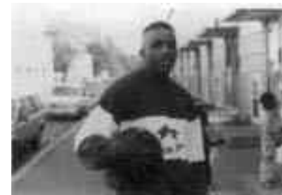
The acclaimed documentary film Hoop Dreams , directed by Steve James, received Media Arts Program support in 1989, five years before it was released.