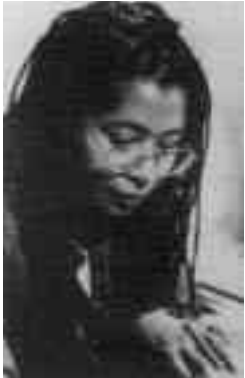
Alice Walker, author of The Color Purple, received an Endowment Discovery Award on the basis of her first novel in 1970.