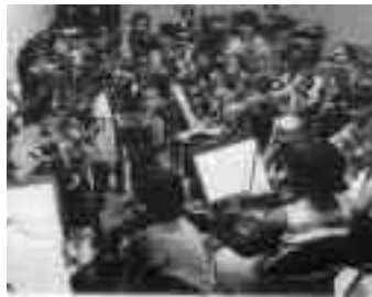
The Harlem School of the Arts received support from the Endowment's Expansion Arts Program to fund its community-based programs.

Existing peer panels are expanded and additional panels are established for the Literature, Museum, Expansion Arts, Public Media and Special Projects Programs. As American Samoa matches its first grant, all 55 eligible state and jurisdictional arts agencies* are, for the first time, receiving Basic State Grants.