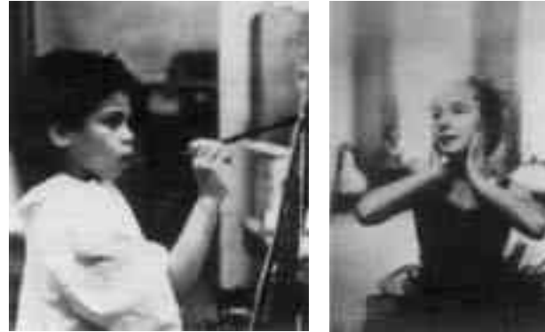
Two young aspiring artists, among the millions of children reached through the Endowment's Arts in Education Program.

Later that fall, the Arts Endowment and the Exxon Corporation announce a joint venture to help Affiliate Artists develop young conductors for positions as music directors of American symphony orchestras. Exxon's partnership with the Endowment is later extended to public television programs and other efforts.