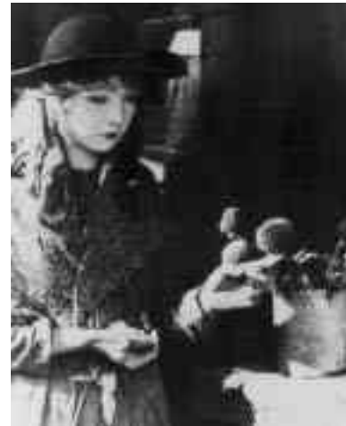
Created by the Endowment in 1967, the American Film Institute has been at the forefront of preserving America's rich film heritage, including Broken Blossoms (1919) starring Lillian Gish.

On June 20, 1967, President Johnson requests the Federal Council on the Arts and the Humanities to prepare a report on the status of the nation's museums. The Federal Council commissions the American Association of Museums to undertake this project.