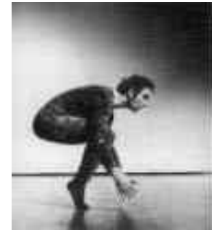
Merce Cunningham, shown here in Solo (1973), was another American dance giant to receive support in the 1960s.