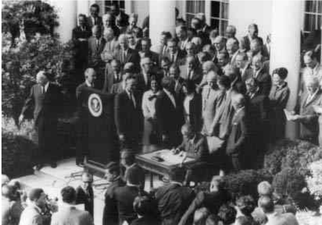
President Johnson signs the National Foundation on the Arts and the Humanities Act, establishing the National Endowment for the Arts and the National Endowment for the Humanities, on September 29, 1965.