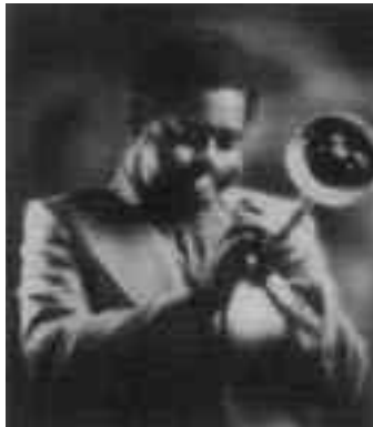
The great Dizzy Gillespie was honored in 1982 with the American Jazz Masters award from the Music Program.

The first National Heritage Fellowships in the Folk Arts honor 15 outstanding folk artists. Later that fall, with the help of Endowment grants, the National Assembly of State Arts Agencies publishes All in Order: Information Standards for the Arts , which includes the National Standards for Arts Information Exchange. The Standards provide a basis for coordinated information management in the arts.