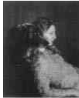
After receiving a 1973 Fellowship from the Visual Arts Program, photographer William Wegman went on to renown for his whimsical portraits featuring Weimaraners.

On April 2–3, 1973, the First Federal Design Assembly, sponsored by the Federal Council on the Arts and the Humanities, is held to increase the awareness by Federal administrators of the importance of good design.