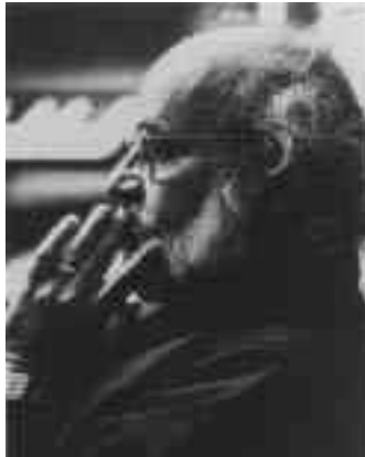
Recipient of a Composers Fellowship from the Music Program in 1978, Morton Subotnick.

In November, the Endowment encourages the establishment of a 23-member task force to determine the needs of the Hispanic arts community in the U.S. and to recommend ways to strengthen its culture and relationship with the agency.