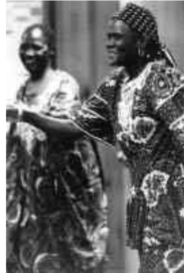
Sudanese immigrants in Iowa rehearse traditional dances as part of the Des Moines Playhouse's Culture Café, a series of performances featuring the city's immigrants and supported by an ArtsREACH grant.

The Arts Endowment conducts a major assessment of its support for organizational development through Planning & Stabilization grants. A series of colloquia, open to the arts community, is held in Washington, D.C. to examine issues such as audience development, information technology, leadership and capitalization strategies for arts organizations.