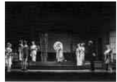
The 1977 touring production of Madame Butterfly produced by the Cincinnati Opera Company.