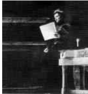
Singing in a role written especially for her, mezzo-soprano Frederica von Stade stars in the Dallas Opera's world premiere of Dominick Argento's The Aspern Papers , broadcast on the PBS series Great Performances in 1988.

The Arts in America , an inventory of the nation's artistic resources, is published by the NEA in the fall. Previous NEA sources of statistical data prove helpful in its publication: A Sourcebook of Arts