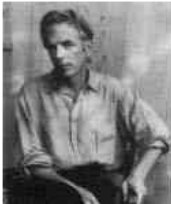
Spalding Gray, writer and performer, received an Endowment Fellowship in 1980.

The Endowment's budget is $154,610,000. A White House reception marks the 15th anniversary of the Endowment, and Chairman Biddle says: "Nothing is more enviable — or daunting — than the opportunity to make a practical reality out of a visionary dream. Yet today we see the phrases of the legislation that created the National Endowment for the Arts 15 years ago translated into goals, programs and accomplishments."