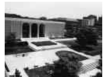
The Sheldon Memorial Art Gallery in Lincoln, Nebraska received a grant from the Visual Arts Program to open its new sculpture garden.

A grant to the College Entrance Examination Board supported the establishment of three innovative Advanced Placement Courses, two in the visual arts and one in music. This is the first time that the arts have been included in the Board's program for high school seniors, which provides college credit and advances students immediately beyond the introductory courses offered college freshmen.