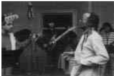
American Jazz Master Cecil Taylor works with students at the New England Conservatory as part of a 1990 Music Program grant.

At a ceremony in the White House on November 17, 1989, President Bush awards the National Medals of Arts, noting: "Art opens entire new worlds for each of us, letting us see and hear and even feel life through the mind of someone else—from new perspectives. And instead of seeing a single world, we can see as many worlds as there are artists and writers, dancers and musicians."