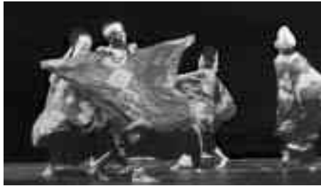
The African-American Dance Ensemble of Durham, North Carolina dances in the lamban style, indigenous to the Sene Gambis area of West Africa. The Ensemble received a Heritage & Preservation grant in 1997.

Fiscal Year 1997 marks the first year the changes mandated by Congress and planned by the Endowment's administration the previous year are implemented.