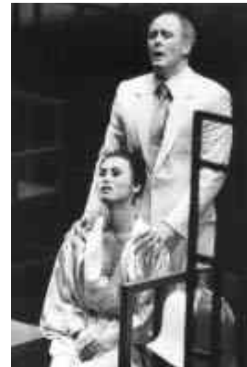
B.D. Wong and John Lithgow in M. Butterfly, the Broadway success by David Henry Hwang, a Theater Program Playwrights Fellowship recipient.

An extensive evaluation of the Test Program of Support for Local Arts Agencies confirms the capacity of Federal dollars to increase public arts funding at state and local levels. The Endowment establishes the Locals Program as a full Endowment program. The