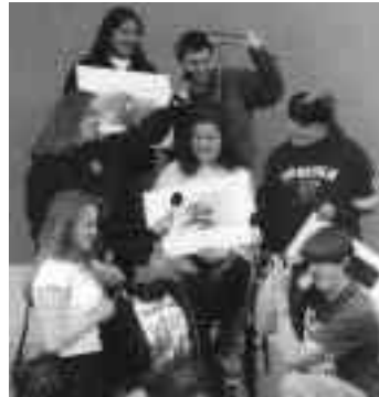
Voices of Youth project interns display their work at the Western Folklife Center in Elko, Nevada. The Center received a 1998 grant to train students from Nevada Basque, ranching, mining and Native American communities in photography and sound recording.

Jane Alexander, Chairman of the Endowment since 1993, steps down at the end of her four-year term in October. She states, "It