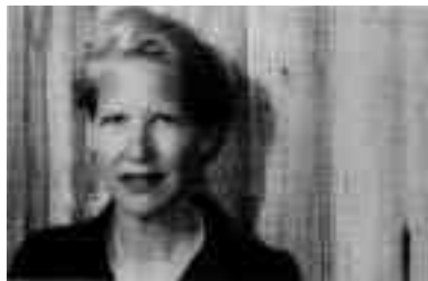
Poet, essayist and novelist Annie Dillard received a Literature Program Fellowship in 1981.

After the inauguration of President Ronald Reagan, the White House Conference on Aging is held on February 1–3, 1981. The Endowment sponsors a symposium focusing on the demand for and character of arts and humanities programs for older Americans.