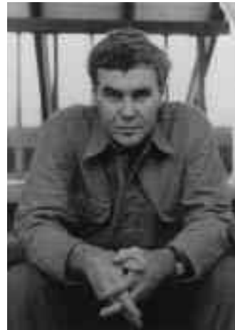
Short story writer extraordinaire Raymond Carver was the recipient of a Literature Program fellowship in 1980.

The Inter-Arts Program formalizes its support of arts presenters, artists' colonies, services and interdisciplinary arts projects. The Folk Arts Program announces the establishment of National Heritage Fellowships to honor exemplary traditional artists. The Music Program offers support for festivals, recordings of American music, professional training, and solo recitalists. The Theater Program extends its support of playwrights, directors, designers and other theater artists through