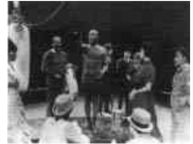
The creation of the play The Great White Hope by Howard Sackler was supported by a Theater Program grant. James Earl Jones, center, appears with Jane Alexander and cast in the original production by Arena Stage in Washington, D.C.

At the next meeting of the Council in Washington, D.C., support for literary festivals and grants to young writers is recommended. The Endowment helps establish the Theatre Development Fund, and arts demonstration projects in New York City, Buffalo, Minneapolis and Louisville are funded in partnership with the newly formed AFL-CIO Council for Scientific, Professional and Cultural Employees. During that same autumn, at the instigation of David Rockefeller and other corporate leaders, the Business Committee for the Arts is established under the chairmanship of C. Douglas Dillon to stimulate corporate support for the arts.