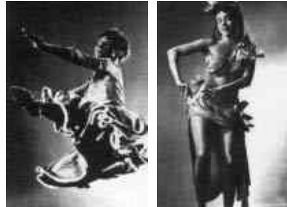
Two of America's legendary dancers, Pearl Primus (in Hard Time Blues, 1943), and Katherine Dunham (in Rara Tonga, 1937) bridge the generations as choreographers in the early 1980s.

At a White House reception for the arts on April 2, President Jimmy Carter says: “[G]overnment can provide nourishment to the ground within which these ideas spring forth from the seeds of inspiration within the human mind.”