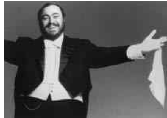
In Live From Lincoln Center, the world-renowned tenor Luciano Pavarotti dazzles millions of public broadcasting viewers in a telecast from the Metropolitan Opera House.

Vice President Walter Mondale’s wife Joan is named Honorary Chairperson of the Federal Council on the Arts and the Humanities and takes an active role in promoting the arts.