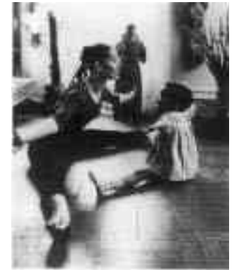
Carmen de Lavallade and Leo by Moneta J. Sleet, Jr. (1960) was part of the exhibition "A Century of Black Photographers" at Atlanta's High Museum of Art in 1984.

On May 31, 1984, President Reagan signs into law legislation for the National Medal of Arts, authorizing the President to award up to 12 medals a year to "individuals or groups who in the President's judgment are deserving of special recognition by reason of their outstanding contributions to the excellence, growth, support and availability of the arts in the United States." The Medals are to be based on recommendations of the National Council on the Arts.