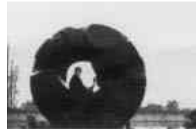
An Art in Public Places grant from the Visual Arts Program made possible the dedication of Isamu Noguchi's Black Sun in Seattle in 1969.

The Rockefeller Foundation matches an $85,000 grant from the Public Media Program to the National Educational Television Network to complete the presentation of four plays by four resident professional theater companies on public television.