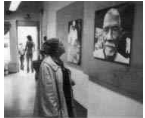
A visitor at the Museo del Barrio in New York takes in the special exhibition on African influences in Puerto Rican art.

On January 7, 1983, the Endowment's second Chairman, Nancy Hanks, dies after a long battle with cancer. Three weeks later, on January 26, President Reagan requests Congress to name the Old Post Office complex, which is to be the new home of the two Endowments, the Nancy Hanks Center. On February 15th, the President signs Public Law 98-1, the first bill of the new Congress, stating: "This designation is particularly apt since the renovation of the Old Post Office, its occupancy this year by Federal cultural agencies and commercial enterprises and its exhibits are due in large measure to the foresightedness, persuasiveness, intellect and vigor of Nancy Hanks."