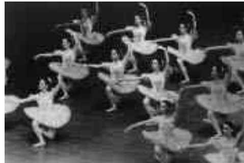
The first Arts Endowment grant went to the American Ballet Theatre, shown here in a production of Symphonie Concertante .

At the fifth meeting of the Council, the Federal-State Partnership Program, mandated by law to begin in Fiscal Year 1967, is launched, with $2 million to be made available to all 50 states and special U.S. jurisdictions. The first grants for non-profit professional theaters are recommended, and funds are set aside for art in public places. The Council discusses and later recommends ways to involve the United States in international arts events. A matching grant is made to provide a United States exhibit, assembled by the National Collection of Fine Arts of the Smithsonian Institution, at the September 1966 Biennale in Venice.