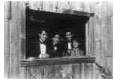
The Chamber Music Rural Residency Program sent small ensembles to live, work and perform in rural communities in Kansas, Iowa and Georgia in 1992. Pictured is the Ying Quartet in Jessup, Iowa.