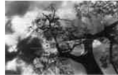
Photographer Lee Friedlander received a Fellowship from the Visual Arts Program in 1973. This work is entitled Japan 1981.