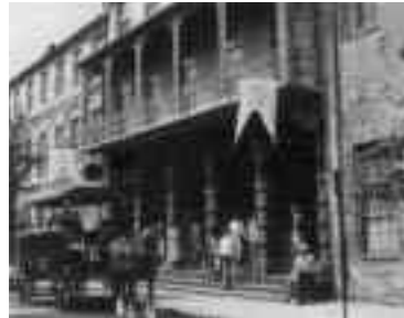
Spoletto Festival U.S.A. audiences attend an afternoon concert at Charleston's historic Dock Street Theatre, dating from 1736. The Spoletto Festival U.S.A. was founded with Endowment support in 1977.

After 18 months of work, the National Assembly of State Arts Agencies' Federal-State Study Committee released in May a recommendation that "an ongoing, structured process of policy planning between the Endowment and the state arts agencies be established on a formal, Endowment-wide basis."