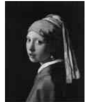
The Arts Indemnity Program insures masterworks, such as Vermeer's Girl with a Pearl Earring (17th century), traveling from their home collections abroad to the U.S. This painting from the Royal Cabinet of Paintings Mauritshuis, The Hague, traveled to the National Gallery of Art, Washington, D.C.