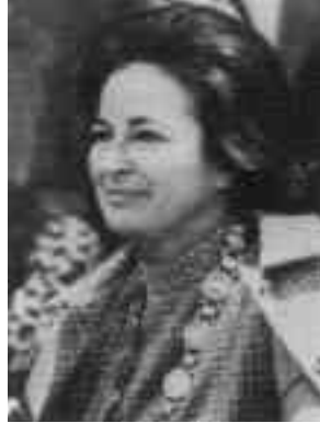
Nancy Hanks* (1969–77)