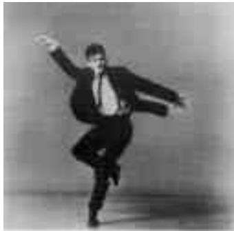
Choreographer Mark Morris, recipient of a 1985 Dance Program Fellowship, in One Charming Night.

of the proposed change is to encourage arts education as a basic part of the curriculum, kindergarten through high school.