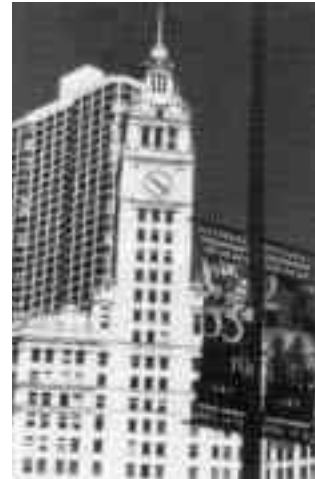
In Chicago, banners for Art-21: Art Reaches Into the 21st Century , the first national conference on the arts sponsored by the Federal government, are displayed.

The Research Division publishes Trends in Artist Occupations: 1970–1990 , which uses U.S. Census figures to show a 127 percent increase in the number of artists over that 20 year period, for a total of over 1.67 million artists in the U.S.