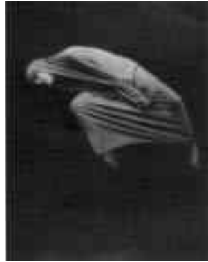
Martha Graham, shown here in Lamentation in 1930, was one of eight master choreographers supported in the agency's first year.

The third meeting of the National Council on the Arts is held on November 13-15, 1965, in Tarrytown, New York. The Council discusses whether to use outside panels and resolves that the Chairman "appoint committees of interested and qualified persons or organizations to advise the Council with respect to projects, policies or special studies as may be undertaken by the Council from time to time."