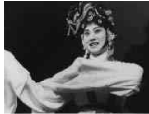
Wenyi Hua, internationally regarded as the premier artist in kunqu, one of China's oldest and most refined forms of opera, and recipient of a 1997 National Heritage Fellowship.

The Endowment publishes Imagine , a resource and information guide to help parents provide arts education to their children.