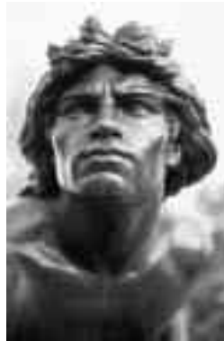
The Indian Hunter in Oak Dale Cemetery in Urbana, Ohio is a replica of an original sculpture by John Quincy Adams Ward. The work is being conserved through Save Outdoor Sculpture.

A new initiative funds artists' residencies in community settings, providing positive alternatives for youth in the form of after-school arts programs.