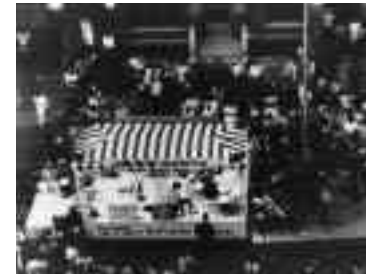
The Jazzmobile, supported through the Endowment's Music Program, is mobbed by scores of music lovers in this 1975 scene.

The National Assembly of State Arts Agencies is incorporated on September 12, 1974 to represent the common interests of the 55