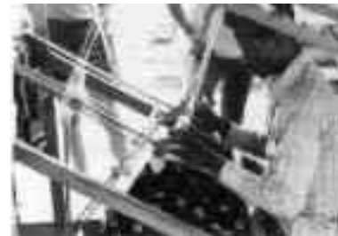
The Arts Endowment was an early supporter of the Smithsonian Institution's Festival of American Folklife. From the 1976 festival, a Ghana weaver plies his craft.

In December, President Ford signs into law S. 1800, the Arts and Artifacts Indemnity Act, authorizing the Federal government, under certain circumstances, to indemnify art, artifacts and other objects to be exhibited internationally.