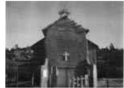
Cornerstones Community Foundation has received long-time Design Program support to save historic adobe churches in New Mexico, such as the Apostol Santiago in Maes, San Miguel County.

The Endowment publishes Arts on Television: 1976–1990 , a history of the Media Arts Program's Arts on Television category that has supported dozens of series and individual programs on public television. In addition, a report co-funded by the Dance Program and the Andrew W. Mellon Foundation, Images of American Dance: Documenting and Preserving a Cultural Heritage , is distributed, pointing to the urgency of coordinated efforts to document and preserve America's unique dance heritage.