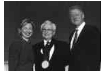
Architect Frank Gehry receives the 1998 National Medal of Arts from President Bill Clinton and First Lady Hillary Rodham Clinton at a White House ceremony.

The 1997 Survey of Public Participation in the Arts is released. It indicates that