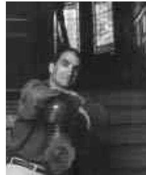
U.S. Poet Laureate and Boston University Professor of English and Creative Writing Robert Pinsky is at the helm of the Favorite Poem Project.