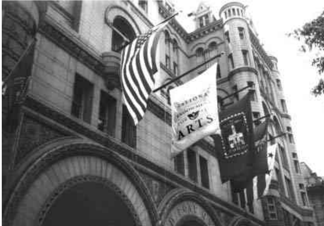
The Pennsylvania Avenue facade of the Nancy Hanks Center at the Old Post Office Building in Washington, D.C. The building, constructed in the 1890's in the Romanesque Revival style and listed in the National Register of Historic Places, is the home of the National Endowment for the Arts.