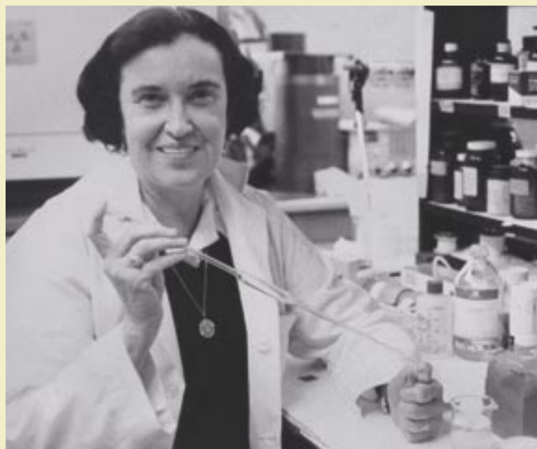
Dr. Rosalyn Yalow at her Bronx Veterans Administration Hospital, October 13, 1977, after learning she was one of three American doctors awarded the Nobel Prize for Physiology or Medicine that year.

After receiving the Nobel, Yalow hosted a five-part dramatic TV series on the life of a famous forerunner, Polish-born physical chemist Marie