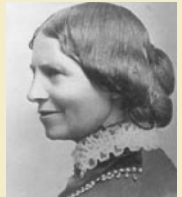
Clockwise, starting from above, a notice marking Clara Barton’s Missing Soldiers office in Washington, D.C.; Barton in 1884; and a spinning wheel frames her field desk at the Clara Barton birthplace and museum in North Oxford, Massachusetts.