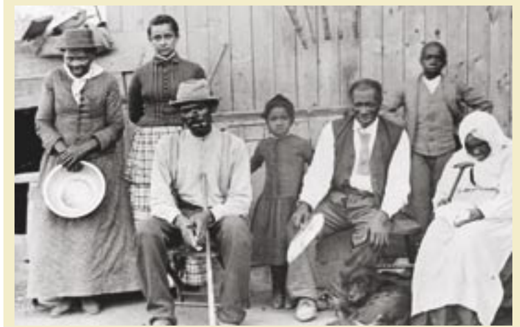
Harriet Tubman, far left, whose talents as Underground Railroad scout freed 300 slaves before the Civil War.

Owing to inefficiency and perhaps lingering racial discrimination, Tubman was denied a government pension after the war and struggled financially for many years. She pressed to advance the status of women and blacks, to shelter orphans and elderly poor people.