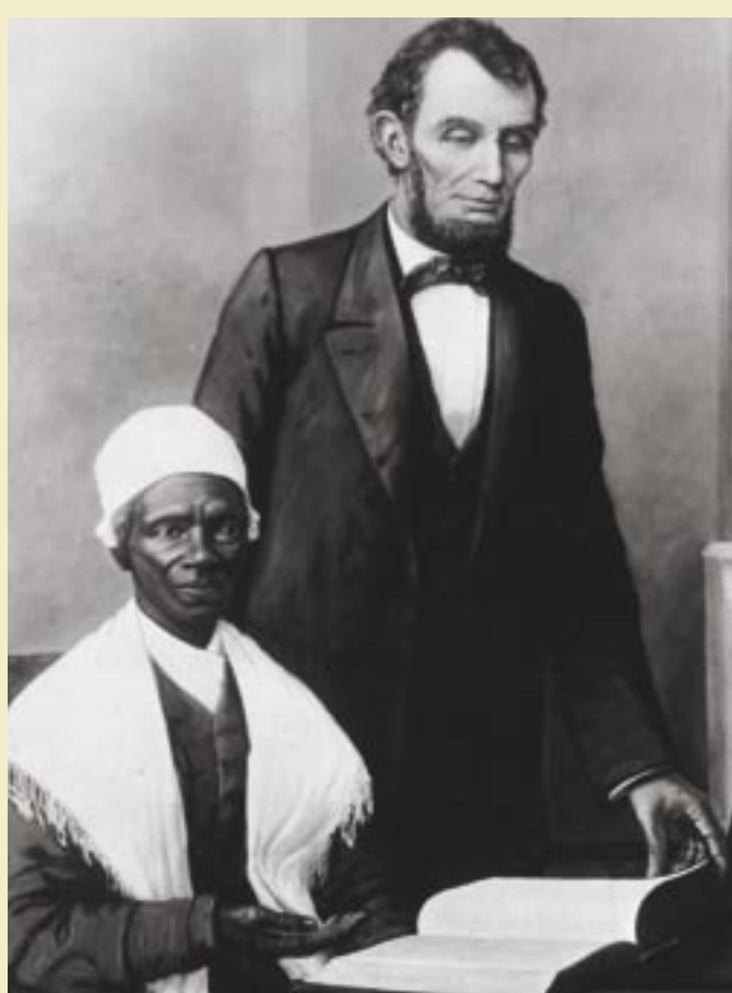
Abraham Lincoln reading the Bible with abolitionist Sojourner Truth. Baltimore's black community presented this print to the president to commemorate the Emancipation Proclamation.

During the Civil War she gathered supplies for black volunteer regiments and she was involved in various political causes. In tribute to her efforts, President Lincoln received her at the White House in 1864. She was appointed to the National Freedman's Relief Association in the same year, where she worked to better conditions for all African Americans.