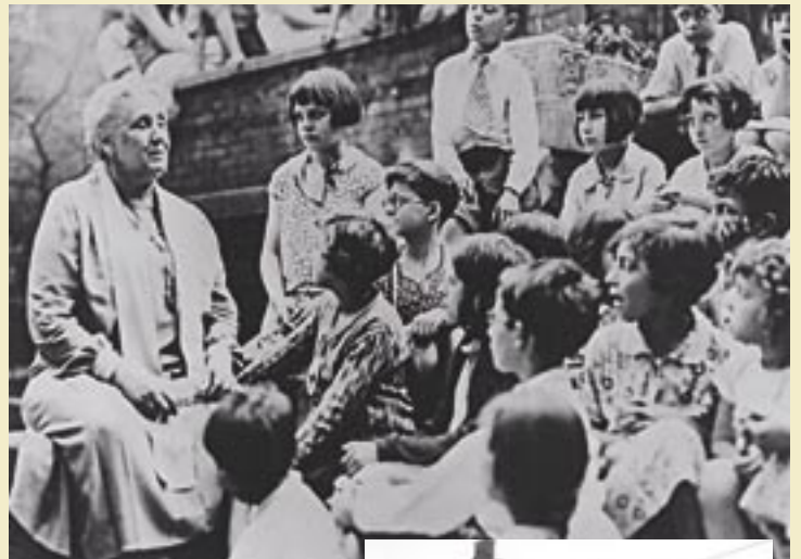
Above, Jane Addams never lost her concern for children and devoted much of her energy to meeting their needs. Right, Hull House in Chicago, Illinois, shown here on July 10, 1946.

Addams directed her talents and unflagging energy to other causes, including women's suffrage, politics (seconding Theodore Roosevelt's nomination by the Progressive Party in 1912), and as a