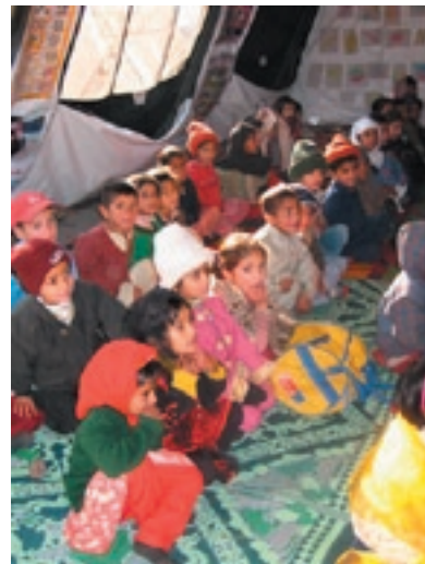
Young earthquake survivors in Pakistan are gathered in a tent similar to the one in Lucy Liu's report.

Oprah also assists charities through the collective action of her viewers. For example, after hearing about the difficulties faced by victims of the 2005 earthquake in Pakistan, Oprah encouraged her viewers to send in donations that would be sent collectively to the stricken area. Actress Lucy Liu, who was featured in a subsequent show visiting a camp in Pakistan as part of her work in support of UNICEF,