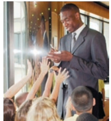
Mutombo greets young autograph seekers.

In 1997, he created the Dikembe Mutombo Foundation, which is dedicated to the eradication of childhood diseases that are now rare in the developed world but that still threaten life everyday in Congo. USA Weekend named Mutombo the 1999 Most Caring Athlete for his efforts to raise money to help support HIV/AIDS efforts in the Democratic Republic of Congo. Those efforts continue, and in 2006 Mutombo convinced the U.S. Congress to promise $2 million to fund clinics and health centers in his homeland. More information on the Dikembe Mutombo Foundation is available at http://www.dmf.org .