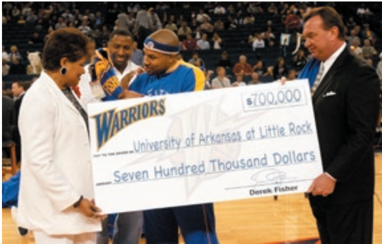
The Golden State Warriors NBA team presents a check to a university.

an annual conference as part of its work. The Legacy League ( http://www.thelegacyleague.com ) works with individual players to establish foundations or charitable programs of particular interest to that individual. The Sports Philanthropy Project can be found at http://www.sportsphilanthropyproject.com .