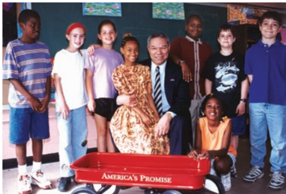
Retired General Colin L. Powell poses with some participants in America’s Promise—The Alliance for Youth.

Most young people who have helped tell me that