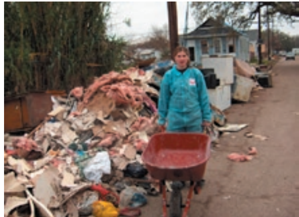
A member of ACCESS helps with clean-up in New Orleans after Hurricane Katrina.

The American Jewish Committee, celebrating its 100th anniversary this year, has a proud tradition of responding to humanitarian crises. Over the years, AJC has contributed millions of dollars in relief and reconstruction projects benefiting people of diverse racial, religious, and ethnic backgrounds in the United States and around the world. AJC can be found at http://www.ajc.org . The ACCESS Web site is http://www.ajc.org/access .