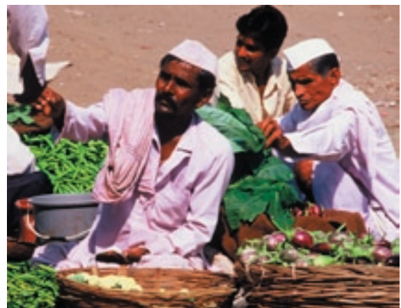
An Acumen Fund water quality project helped these farmers bring a better crop to market, feeding communities and earning a profit.

• TechnoServe helps budding entrepreneurs turn good business ideas into thriving enterprises. With funding from the