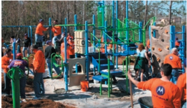
Motorola corporation employees build a community playground in Mississippi.

KaBOOM! is a national nonprofit organization that envisions a great place to play within walking distance of every child in America. Celebrating 10 years of service in 2006, KaBOOM! has used its innovative community-build model to bring together business and community interests to construct nearly 1,000 new playgrounds and skateparks and renovate 1,300 others nationwide. In addition, KaBOOM! offers trainings, challenge grants, and publications for communities to use to plan a new play space on their own.