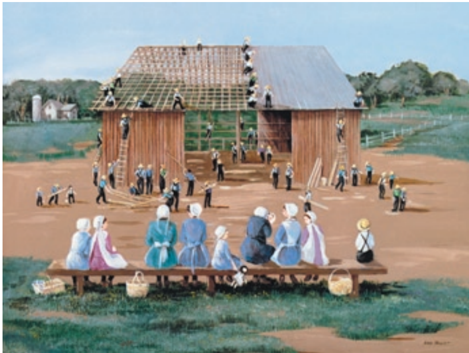
Illustration Courtesy of the Artist and Bentley Publishing Group