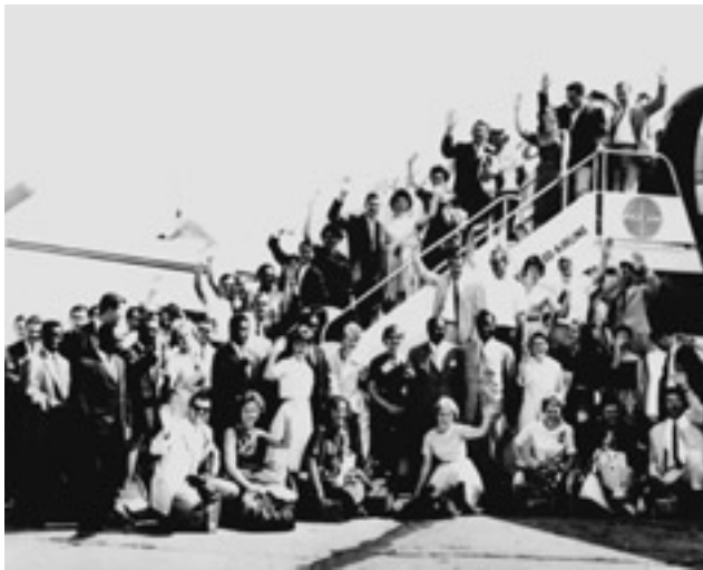
These volunteers arriving in Ghana in 1961, are the first Peace Corps volunteers to begin service. Five other countries received volunteers the same year.

Not unsurprisingly in a diverse society, American leaders adopted a number of approaches to encourage their fellow citizens' volunteer efforts. One was to expend government funds and resources on specific volunteer programs. The Peace Corps is one example. In his 1961 Inaugural Address, President John F. Kennedy issued a call to service: "Ask not what your country can do for you; ask what you can do for your country." These volunteer efforts, Kennedy said, "can truly light the world." Later that year, he created the Peace Corps. The Corps trained volunteers in skills needed in health and education, and agricultural projects, then matched them with requests from foreign governments. By 1966, some 15,000 Americans were serving in nearly 4 dozen countries. President George W. Bush has pledged to double the size of the Peace Corps.