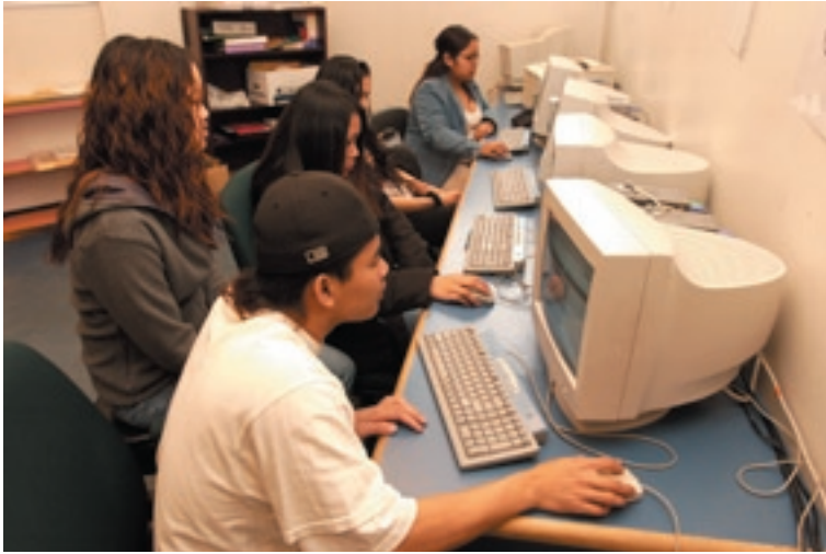
In Massachusetts, former gang members participate in an education and employment project through ROCA, Inc. funded through the Kellogg Foundation.