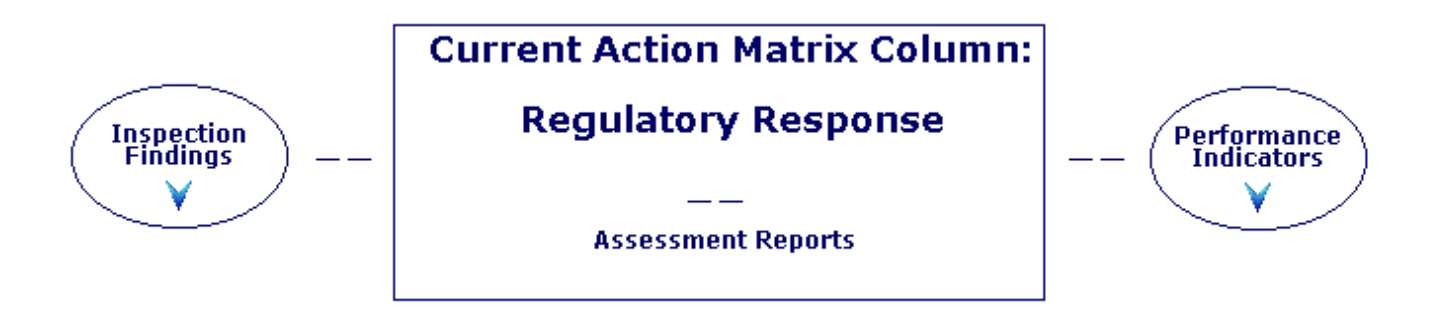
Farley 2 2Q/2006 Performance Summary