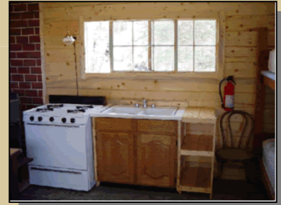
Newly cleaned and polished interior at Jones Corral Guard Station

The forest also operates 19 campgrounds through concessionaires.