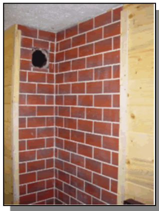
Portion of a new hearth at Jones Corral Guard Station