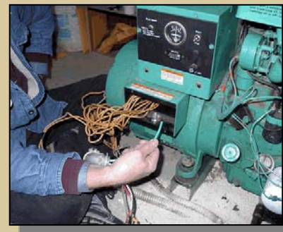
A generator is repaired at Emigration Campground

Specific campground accomplishments included, repairing a generator that provides water to Emigration Campground, replacing valves on flush toilet units at Willow Flat and Emigration Campground, enlarging a parking area in Paris Springs Campground, and installing a fee tube and kiosk at Beaver Creek Campground.