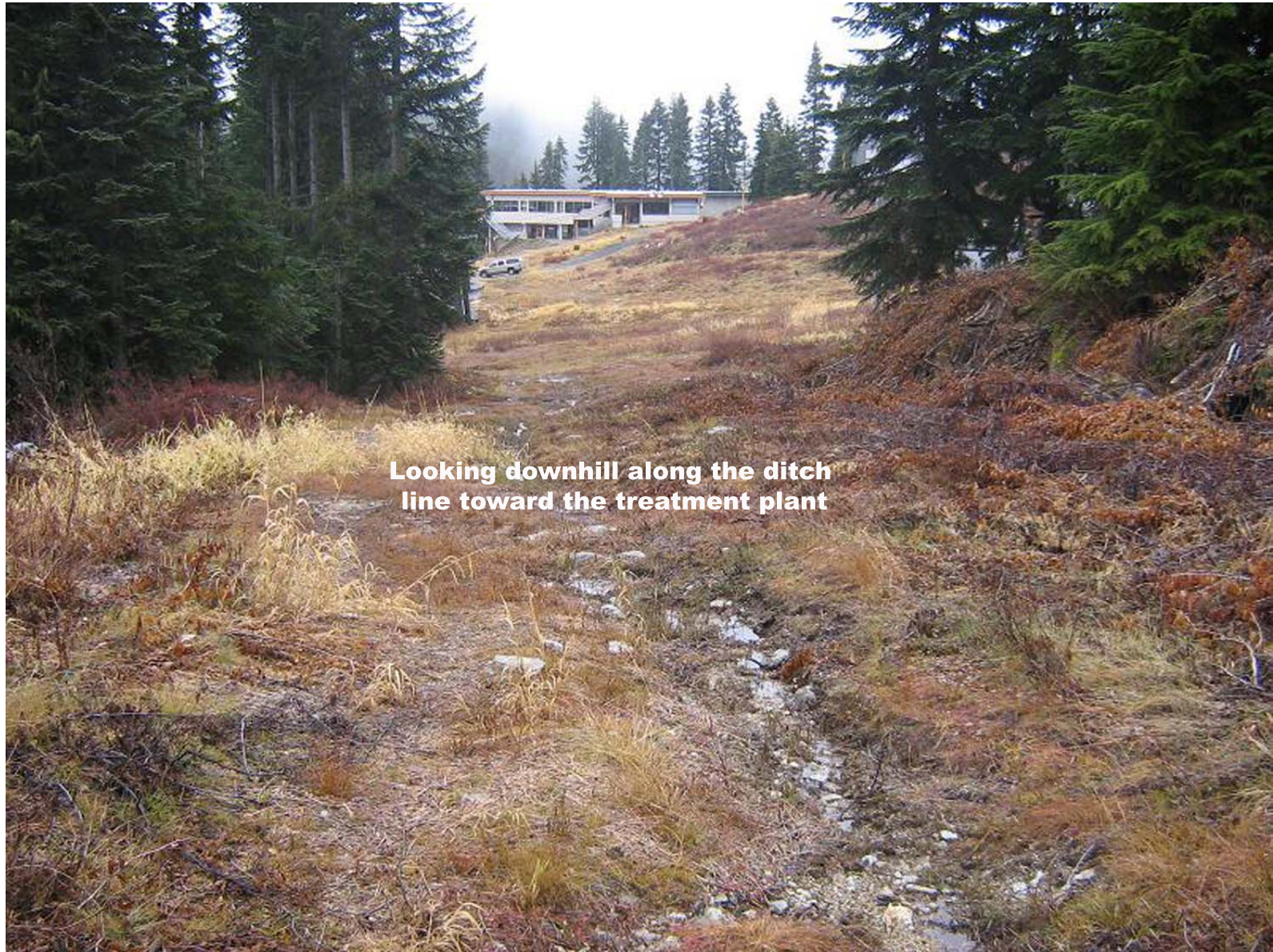
Looking downhill along the ditch line toward the treatment plant