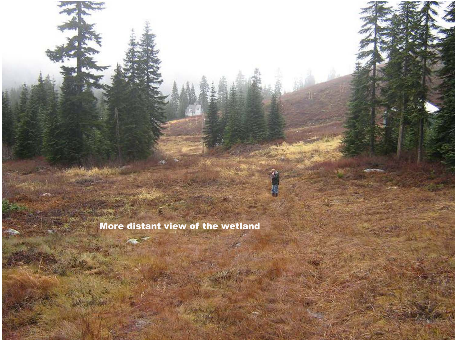
More distant view of the wetland