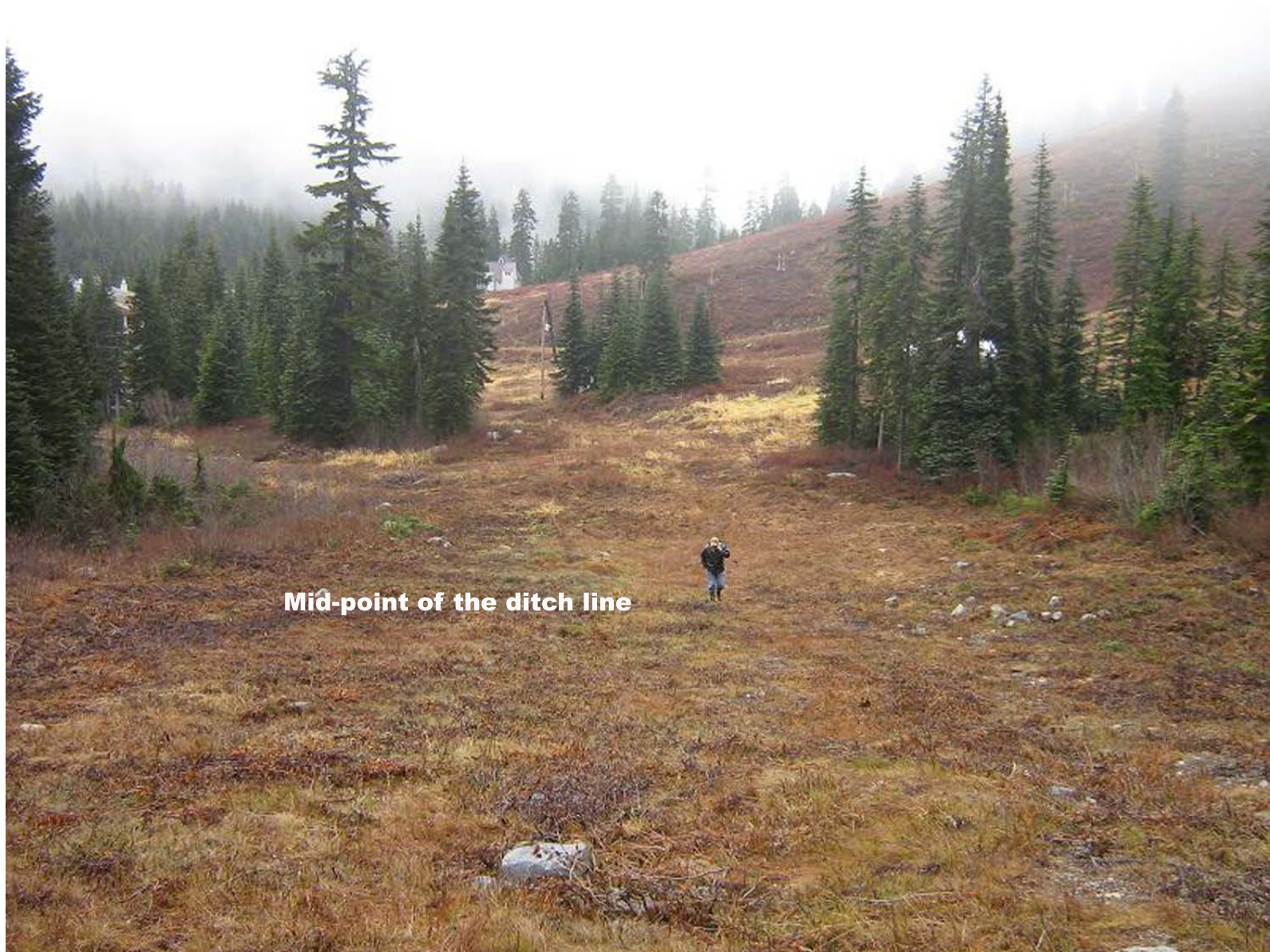
Mid-point of the ditch line