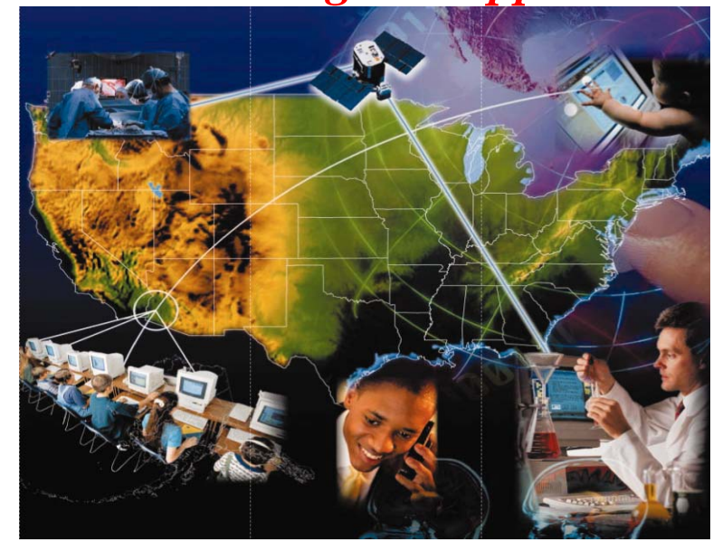
SUBMIT APPLICATIONS TO YOUR RURAL DEVELOPMENT GENERAL FIELD REPRESENTATIVE OR TO WASHINGTON BROADBAND OFFICE AT:

KENNETH KUCHNO BROADBAND DIVISION TELECOMMUNICATIONS PROGRAM RURAL DEVELOPMENT, UTILITIES PROGRAMS U.S. DEPARTMENT OF AGRICULTURE STOP 1599, ROOM 2844-S 1400 INDEPENDENCE AVENUE, SW WASHINGTON, DC 20250-1599