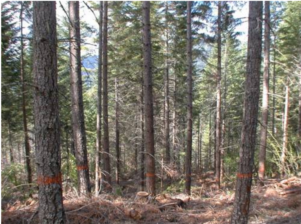
An example of post harvest plantation thinning

For Information Contact: James Rice 595 NW Industrial Way, Estacada, OR 97023