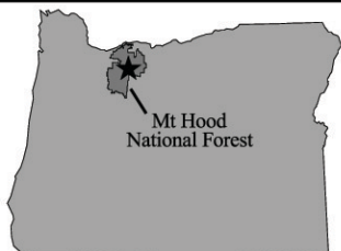
Figure 2 Alternatives Under Consideration