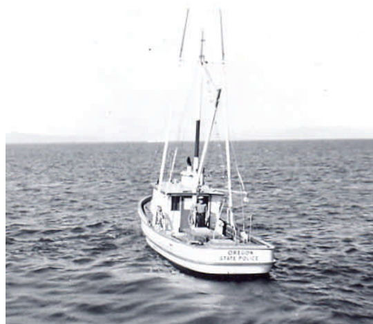
Old OSP Patrol Vessel

Trooper Boyd (Newport) assisted Trooper McGladery (Patrol – Newport) on a traffic stop in Siletz. Located in the trunk of the vehicle was a cooler which contained 22 Bluegill. The driver had his angling privileges suspended for 999 months (from Hood River County). The passenger had no angling license. The driver was cited for Angling While Suspended . The passenger was cited for Unlawful Possession of Bluegill to Wit: No 2007 Angling License .