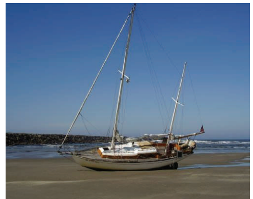
Sailboat Evening Star ran aground

Trooper Turnbo (Salem) and Recruit Skipper (Capitol Mall) were northbound I-5 near MP 258 when they observed a vehicle with numerous traffic violations. They initiated a stop and the vehicle traveled about a 1/2 mile before yielding. As the troopers approached the vehicle, the driver drove off. They pursued the vehicle to Portland Rd. where the passenger exited the vehicle at an intersection. Tpr. Turnbo detained the passenger while Sgt. Heider continued the pursuit. The vehicle was followed into Salem where Sgt. Heider eventually called off the pursuit due to the vehicle passing into oncoming traffic. The vehicle was spotted at Kennedy Elementary School in Keizer and the school was temporarily locked down. A perimeter was set-up around the neighborhood of the school by OSP, Salem PD, and Keizer PD. The suspect was taken into custody by Keizer PD and lodged by Tpr. Turnbo at the Marion County Jail for Attempt to Elude-Felony, Attempt to Elude-Misdemeanor, DWS-Misdemeanor, Reckless Driving and held on a Parole Violation Detainer. The suspect fled because he thought he had a warrant out for his arrest which in fact he did not have.