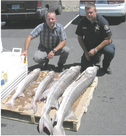
OSP F&amp;W Troopers with seized Sturgeon