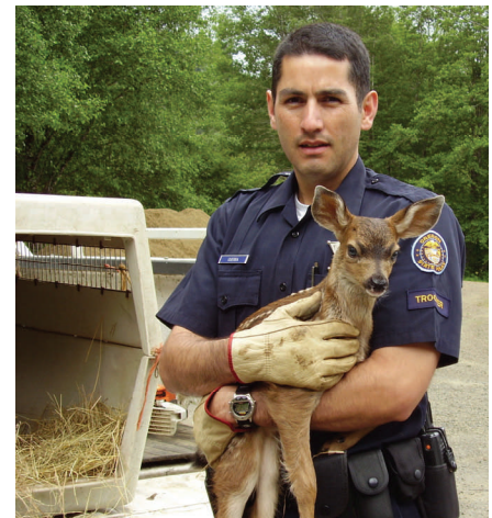
OSP F&W Trooper with rescued fawn from Jewell Meadows Wildlife Refuge. People who find fawns in the wild are instructed to leave them where they are found.