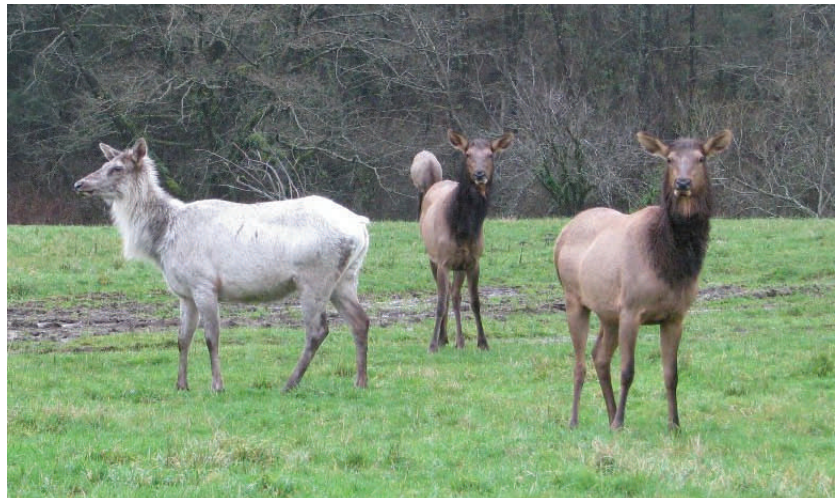
Albino elk in the Tillamook area, photo taken by Sgt. Lane Hendrickson's wife .

Trooper Kehr (Newport) completed an investigation on a local trapper. Earlier in the week Trooper Kehr discovered two leg hold trap sets with illegal sight bait. Trooper Kehr identified and located the trapper. The trapper was cited for Trapping Prohibited Method To Wit: Traps Within 15' of Sight Bait . The trapper was warned for several other violations.