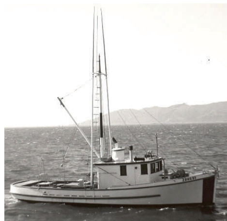
OSP F&W Patrol Boat, 1930's