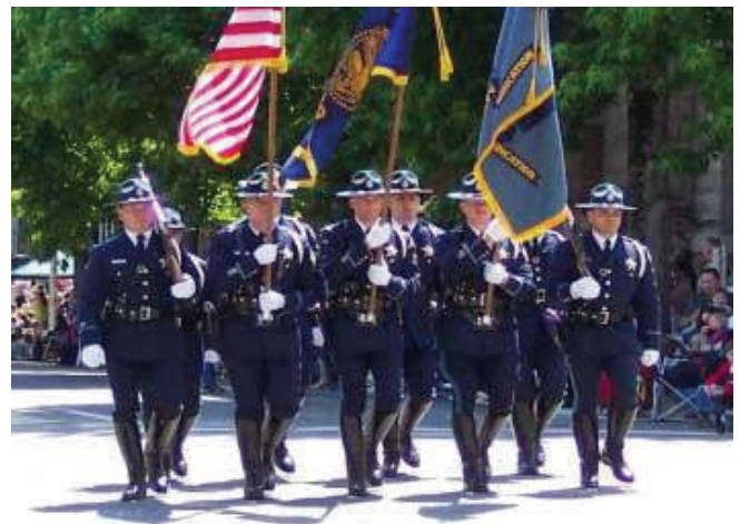
OSP Honor Guard