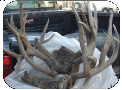
OSP F&W Seized Interlocking Antlers