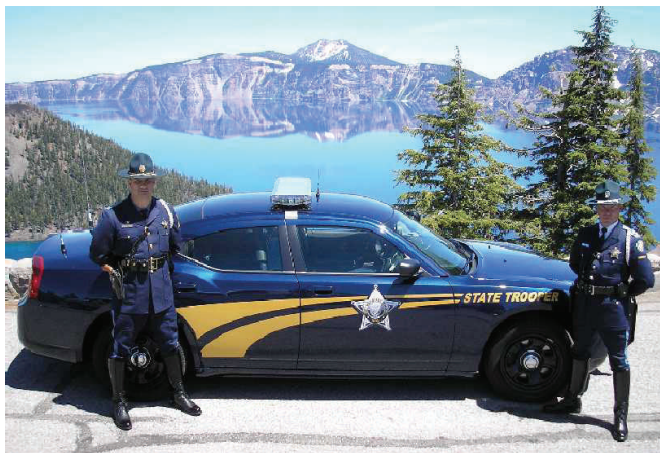
OSP Troopers with new Dodge Charger

Fish & Wildlife Division Troopers assigned to the Baker and Ontario offices participated in a joint state waterfowl and Marine Board saturation patrol on the Snake River. The patrol consisted of Idaho Fish and Game officers, Malheur County Sheriff's Office Marine Deputy, US Fish and Wildlife Service Agents and Oregon State Police Troopers working the border waters of the Snake River upstream well into Idaho. The activities for the patrols conducted on the border waters are as follows: Hunters Checked – 51, Anglers Checked – 2, Outfitters/Guides – 2, Boats Checked – 13; Citations: No Personal Floatation Device (2), No Boat Registration (1); Warnings: (Total of 18), No Boat Registration, Fail to Sign Duck Stamp, No Sound Producing Device, Offensive Littering, No Hunting License in Possession, Angling Prohibited Method, Unlawful Possession of Toxic Shot.