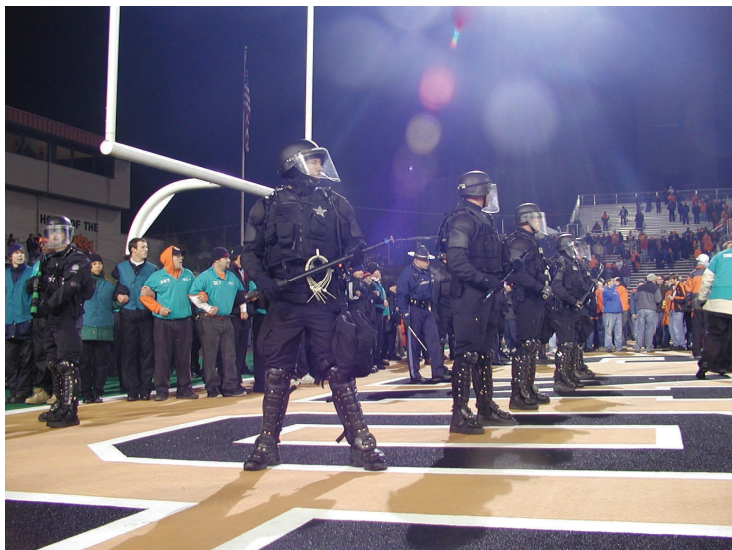
OSP SWAT at OSU game