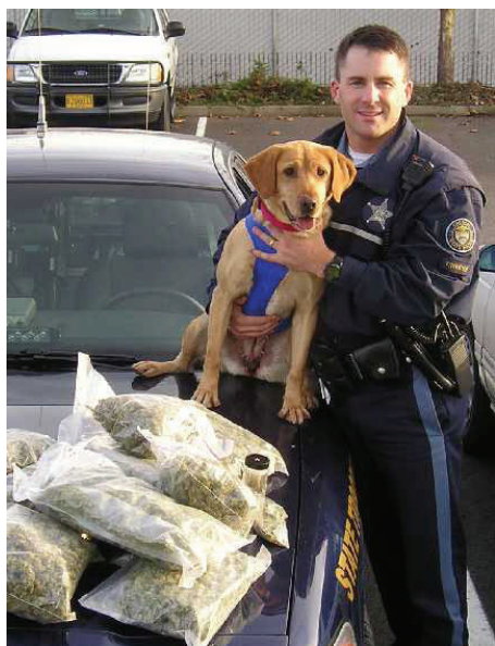
OSP Trooper with K9 "Cookie"

A suspect pled guilty and was sentenced for Taking Elk Without a Tag and Borrowing an Elk Tag. He had a second season elk tag, but hunted the first season and killed an elk. He had concerns about the elk's health and called ODFW to inspect it. He told the biologist about his hunt and how he had made a great shot. The biologist noticed his mother's tag on the elk and called OSP. The suspect claimed his mother was unable to hunt because of her health and he decided to fill her tag. He was fined $1741 and his hunting license was suspended for 2 years.