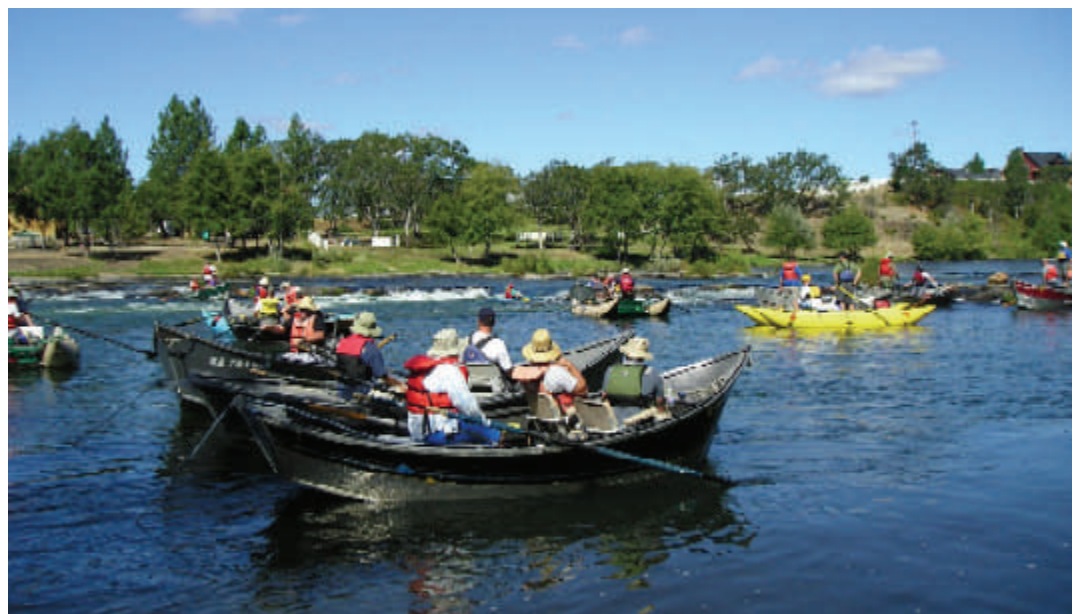
OSP F&W Troopers attending Drift Boat Training