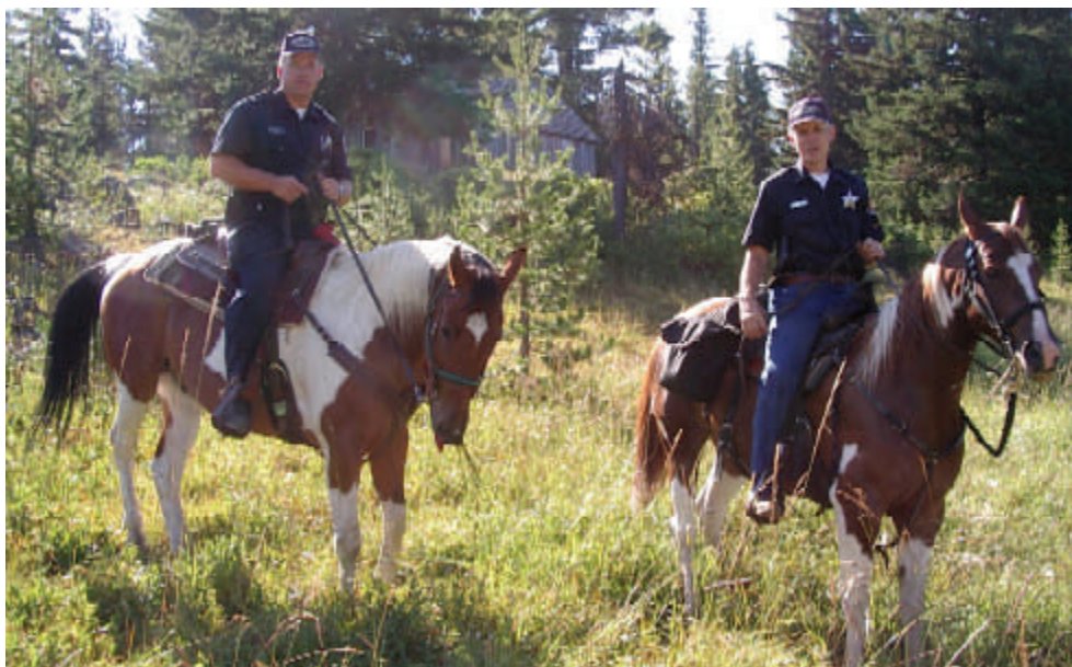
OSP F&W Troopers on Horse Patrol, see news article page 7.