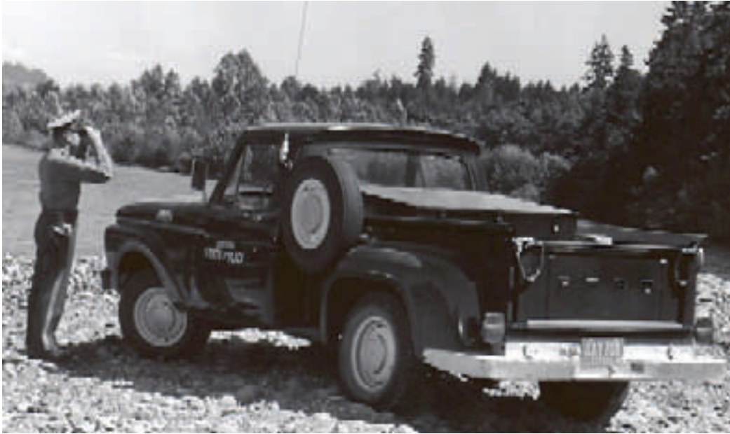
1930's photo of OSP F&W Trooper on Patrol