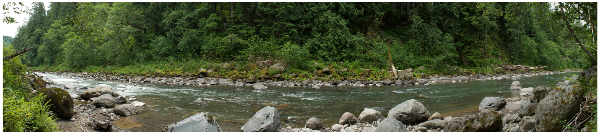
Site 3: below dam; above gage station June 27, 2007