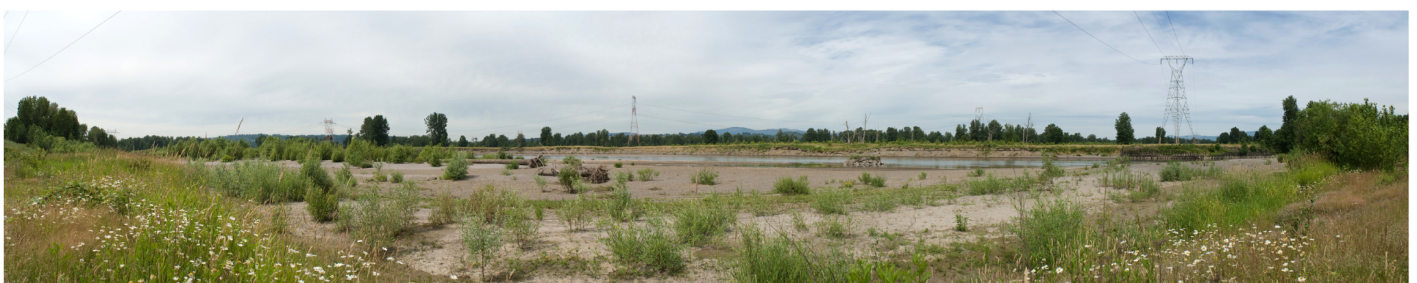
Sandy River delta June 27, 2007