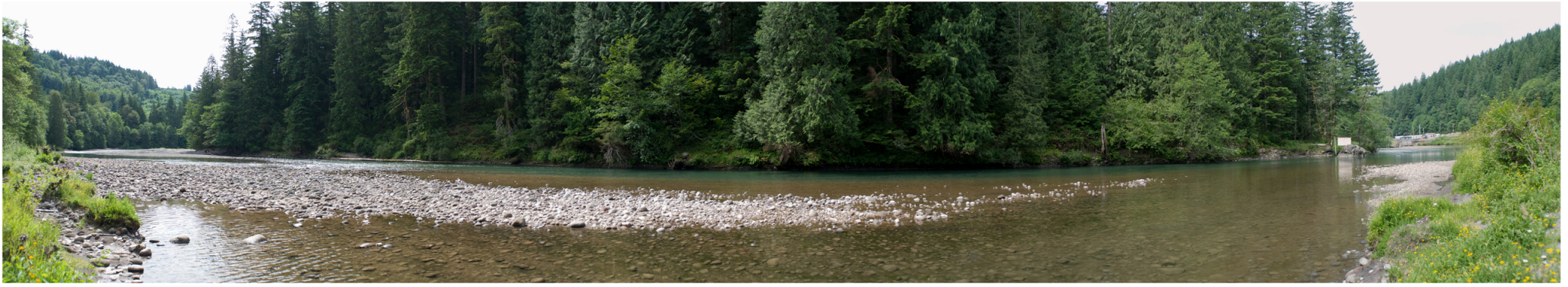
Site 1: above dam June 27, 2007