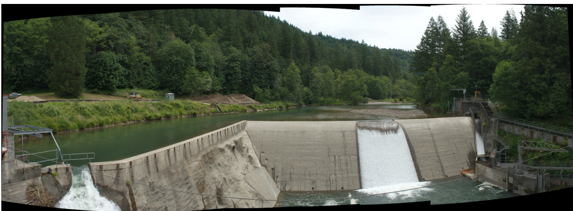
View from footbridge at Marmot Dam