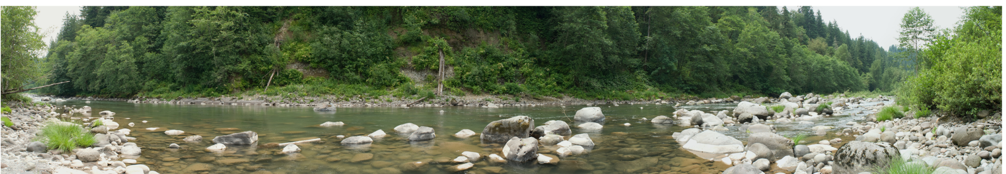
Site 4: below dam June 27, 2007