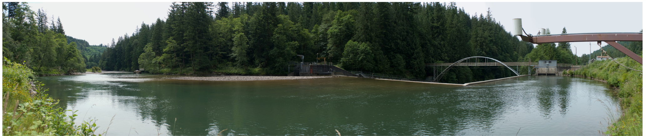
Site 2: at dam June 27, 2007